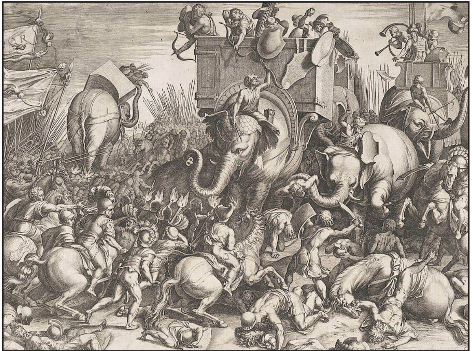
Cornelis Cort 'Battle between Scipio and Hannibal at Zama' (1567)

US historians and military strategists naturally like to raise this angle on the Thucydides trap to argue that, if China decides to invade