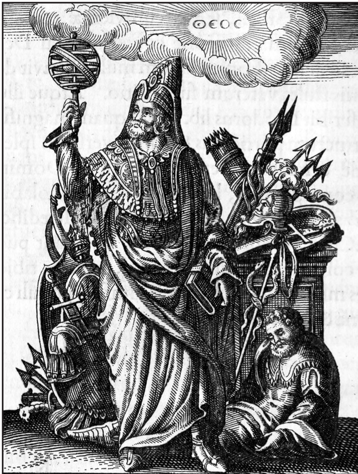
Hermes Trismegistus: bringer of divine wisdom

The deeper failure of the post-war period was one of consciousness. The working class that held free healthcare, public housing and free education understood those gains as government services rather than as won rights in a continuing struggle against the commodity form. A class that understands free healthcare as a government service accepts its erosion as fiscal adjustment, because governments adjust fiscal policy. A class that understands it as a portion of working class life removed from the commodity form through struggle resists its removal as expropriation, because expropriation requires a response proportional to what is being taken. The post-war left built institutions without building the consciousness that would have defended and extended them. A conscious left builds both simultaneously, because the gain and the understanding of the gain are both necessary components of the project.