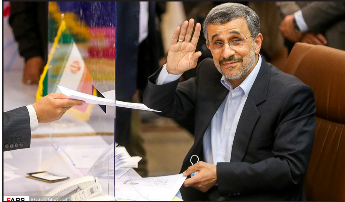
Ahmadinejad in 2021

■ The Strait of Hormuz would be reopened to shipping. This is the most urgent economic issue. The US wants the strait open, safe and free for global shipping. Iran wants recognition of its