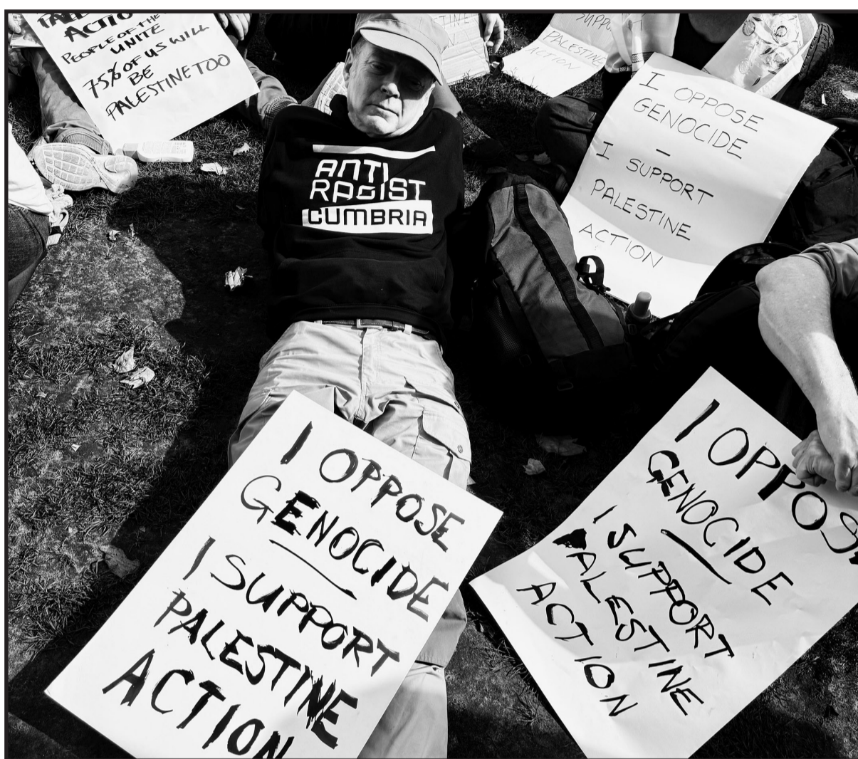
No wonder the court system is clogged

That formulation of “shared democratic principles” really sums it up: the governments and politicians now feigning outrage are generally entirely on board with Israel’s deeply racist policies towards the Palestinians and have supported it for many decades. They might make mealy-mouthed criticism of this or that particularly outrageous action, but