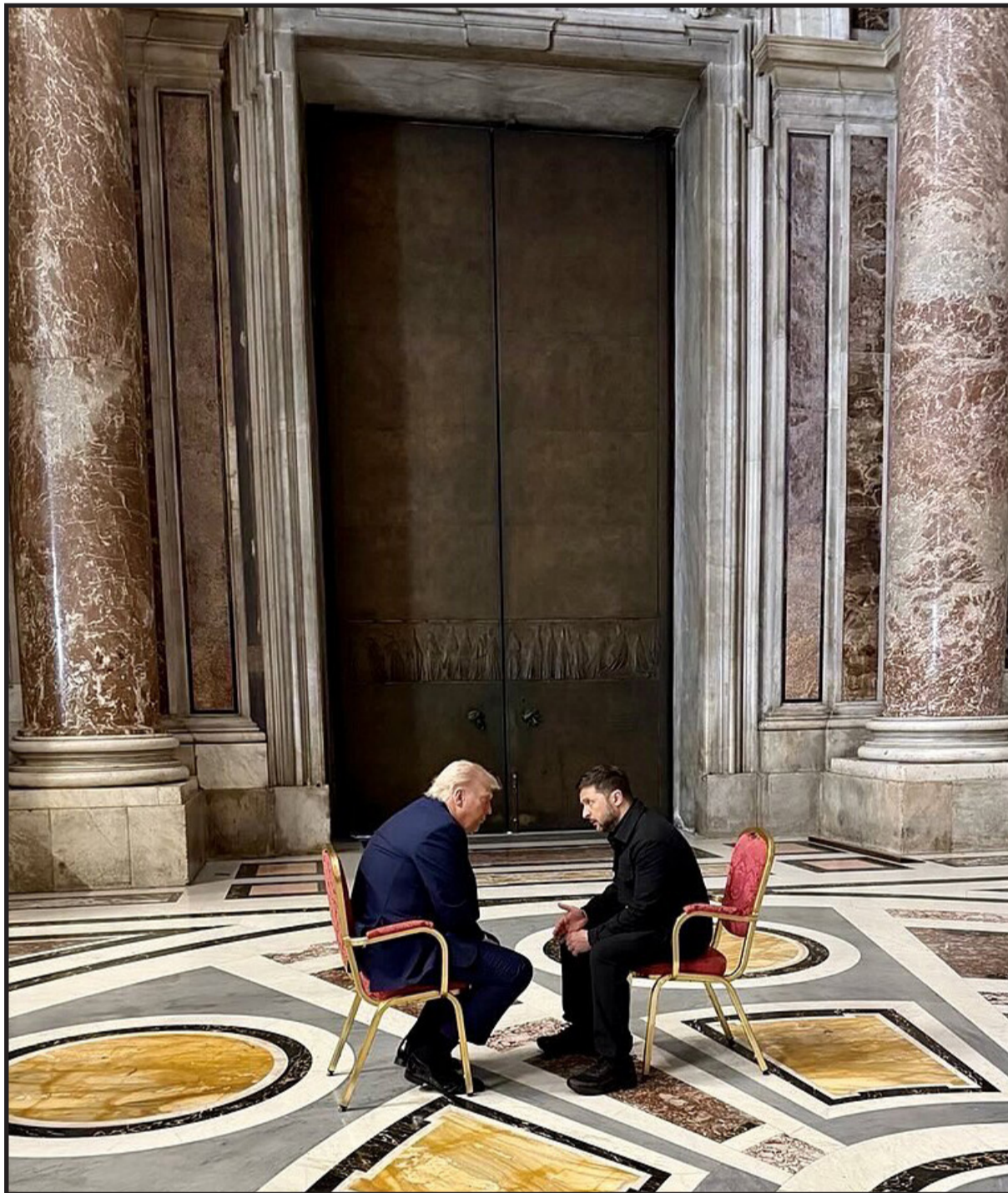
Trump and Zelenskyy: a few more cards now

Meanwhile, it needs stressing, there has been virtually no change on the front line. More than that, though the US administration is focused on negotiations with Iran, the fact remains that the standing American position is to force Volodymyr Zelenskyy and Ukraine into agreeing Donald Trump's 28-point peace plan first mooted back in November 2025. 6 If, and it is a big 'if', there is some sort of deal with Iran, attention in the