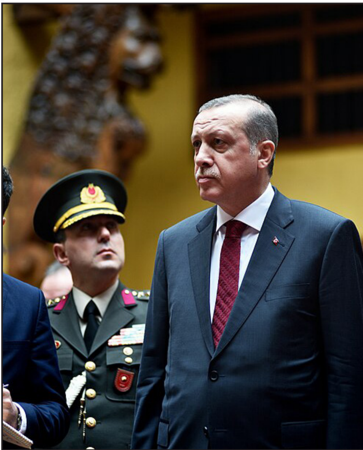
Erdoğan: next president for life?

Now, the spokespersons of Erdoğan's ruling Justice and Development Party (AKP) have the opportunity to claim that the CHP's internal affairs are none of their concern.