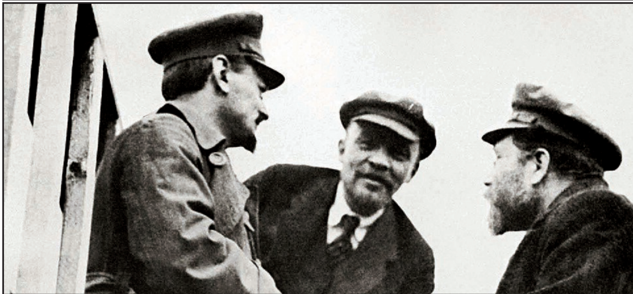
Trotsky, Lenin and Kamenev: all had long factional histories