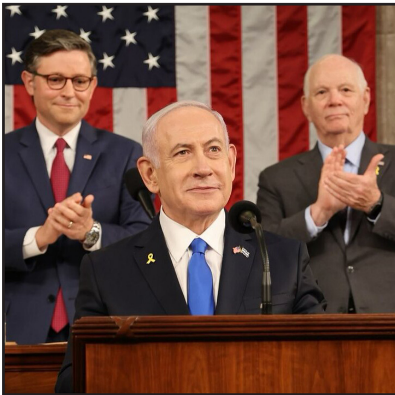
Benjamin Netanyahu addresses Congress with House Speaker Mike Johnson and Senator Ben Cardin clapping approval

China will likely benefit, however, with Iran increasing its alignment with Beijing, whatever else happens. China is playing an important diplomatic role