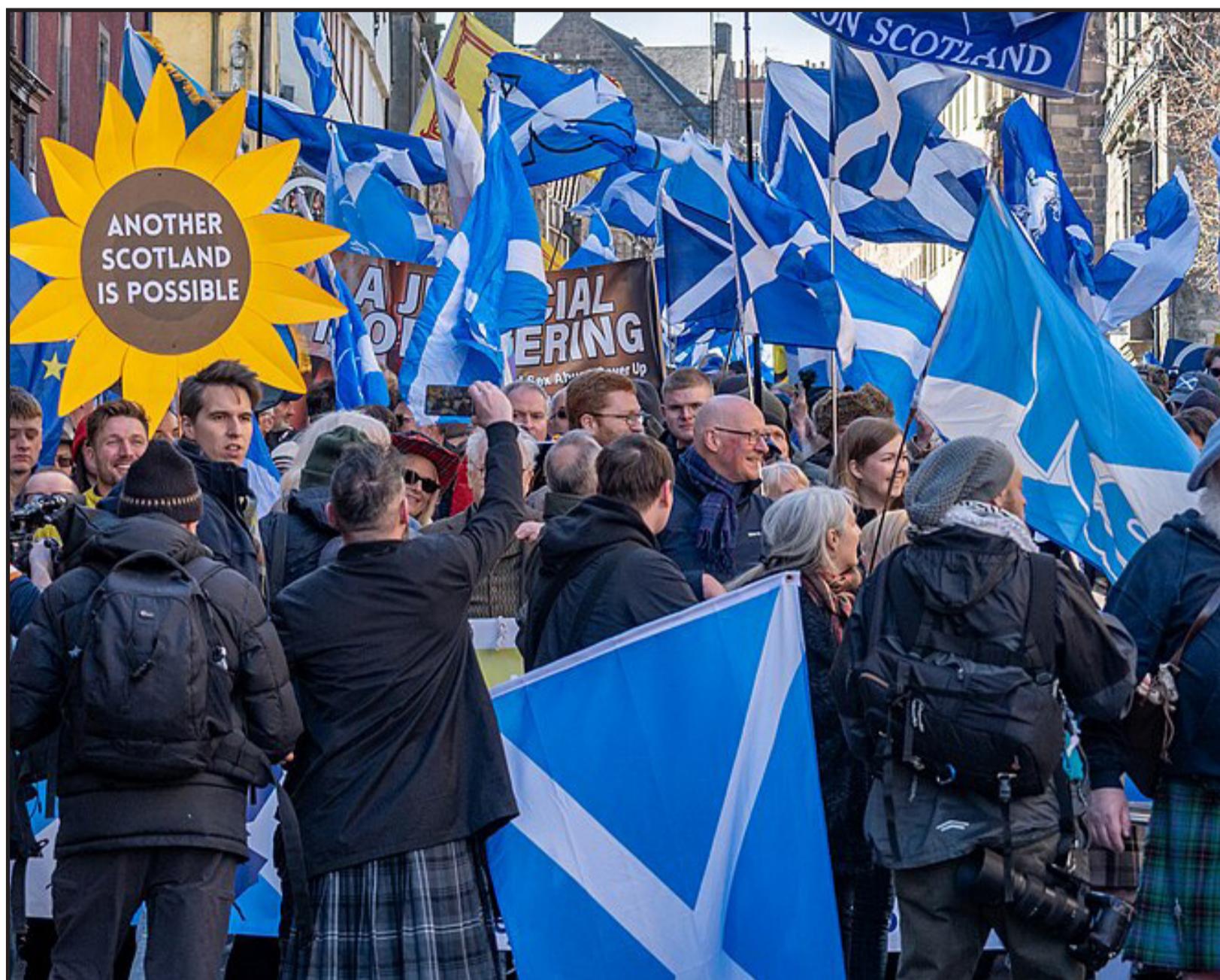
Class unity, not national unity, should be our first and foremost principle

But of course, given Reform's second place in both Scotland and Wales, in reality it is a British