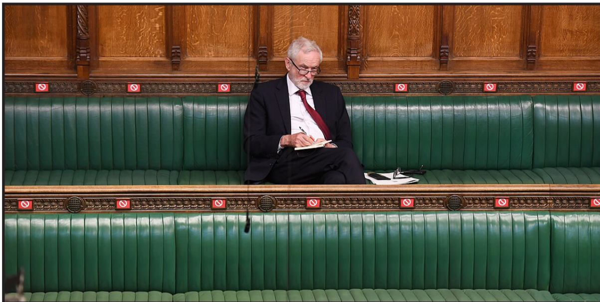
His Party ... will never be a mass party

At best, Rahman and Aspire could be described as communalist-populist. In 2015, Rahman was found guilty of "corrupt and illegal practices" in a previous election. Transport for London withheld £1 million of annual funding because Rahman ended the borough's low traffic neighbourhood scheme to suit local businesses. And he famously refused to use public transport, instead insisting on being driven in a council-funded Mercedes. 2 Rahman is clearly no socialist and it is beyond bizarre to describe Tower Hamlets as "municipal socialism" - which is, of course, a contradiction in terms anyway. You cannot possibly