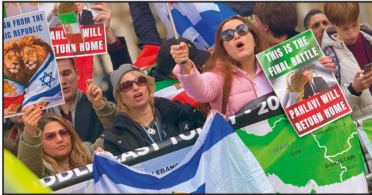
Hand-in-glove: Zionists and Iranian royalists

This year, the section of the march led by those carrying the banners of the Brigata Ebraica placed itself (or was placed by the police) at the head of the march, in front of the ANPI, the long-standing organisers of the Milanese liberation marches. Regardless of whether this positioning was deliberate or accidental, it was in itself provocative. More seriously, the contingent led by the Brigata's supporters included many carrying Israeli flags, as well as people with