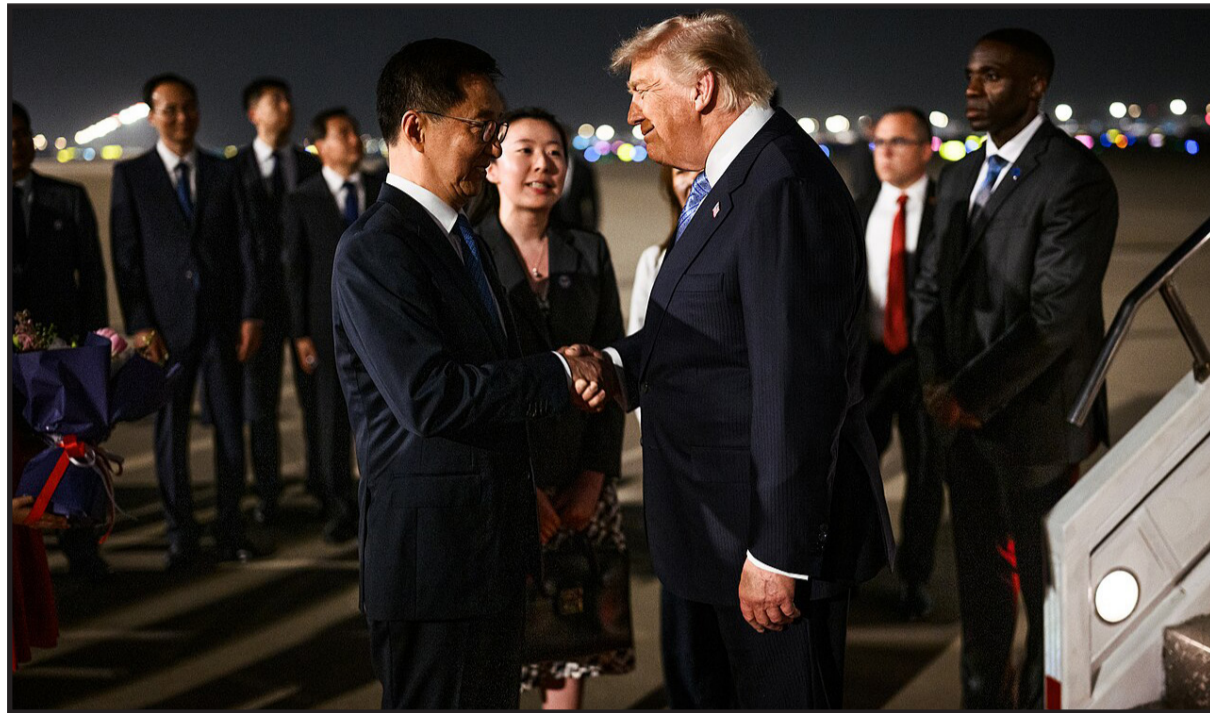
Chinese vice-president Han Zheng greets the Don

The faction I referred to has around six seats in the Majles out of 290. It has no representation in the current 'reformist' government, nor does it play a significant role in the 'conservative'-dominated parliament. It is a pressure group called the Jebheh Paydari (Front for Resistance). It has a loyal following which, back in 2015, opposed Iran's nuclear deal with the US. They were rebuked by the then-