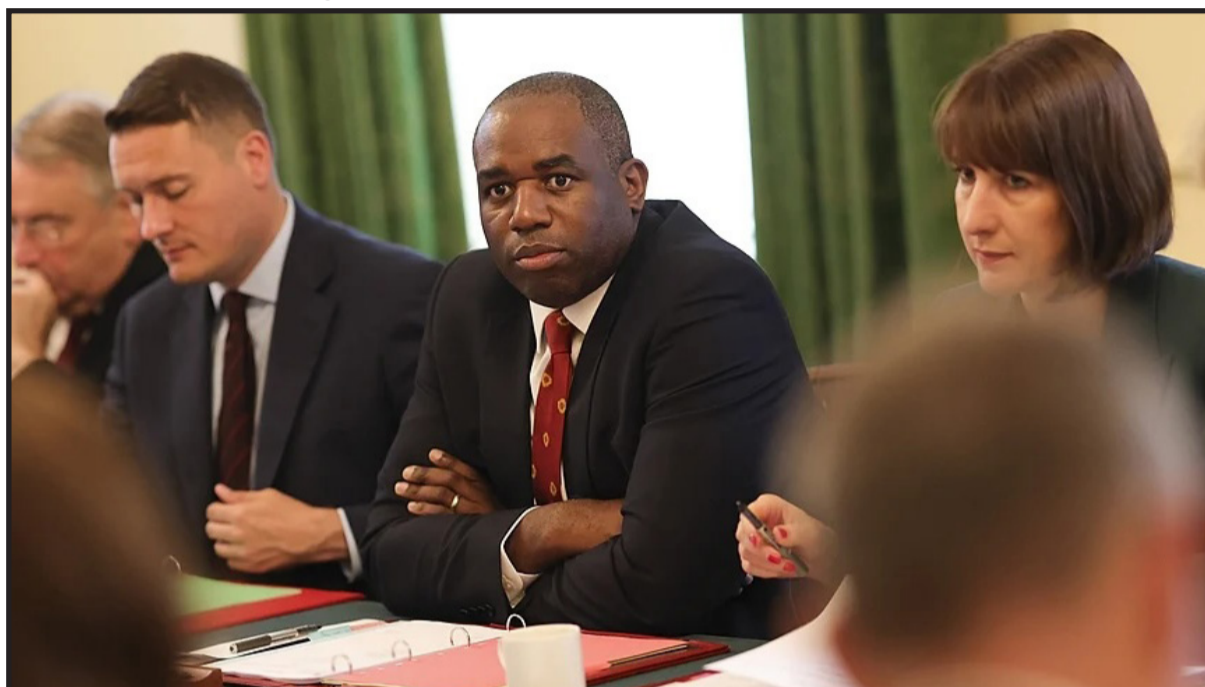
Now they are at each other's throats: Wes Streeting at cabinet meeting alongside Hillary Benn, David Lammy and Rachel Reeves

However, his position is not as weak as it appears, in several ways. In the first place, it is devilishly difficult to make a coup in the Labour Party. Even Jeremy Corbyn, despised by almost all of his parliamentary colleagues, could brass out the attempt on his leadership in 2016, forcing things in the end to a membership vote he was never in any danger of losing. Challenges must be made openly: there is no equivalent of the Tories' 1922 Committee to serve as a clearing house for discreet