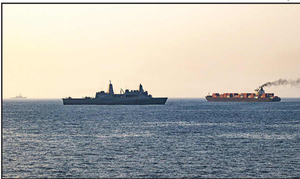
US navy intercepts Iranian cargo ship

There are, however, differences regarding enrichment levels and stockpile limits. All factions agree that