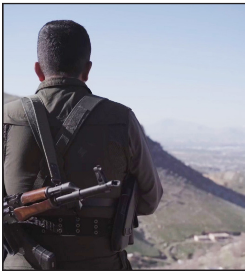
Komala guerrilla fighter

Despite that categorical assurance, Tehran turned the screws on Kurdish opposition forces, launching deadly