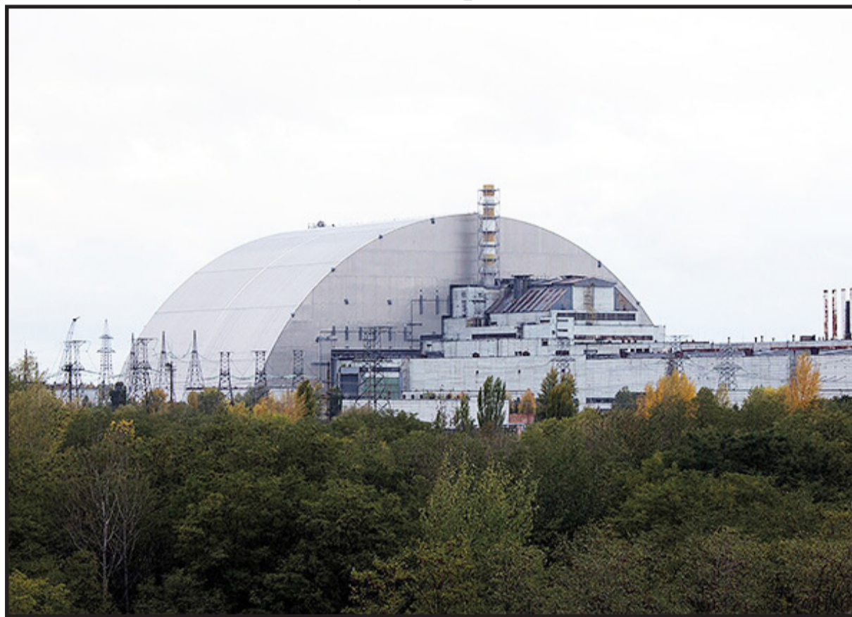
New Safe Confinement: a £1.85 billion structure that dwarfs the Colosseum

This is something that should be given extra urgency by the fact that a Russian drone struck the north-west face of the arch on February 14 2025. Firefighters arrived within minutes, but sealing within the roof had caught alight and kept smouldering. For three whole weeks, teams desperately cut more than 300 holes into the outer wall to reach the hotspots with water hoses.