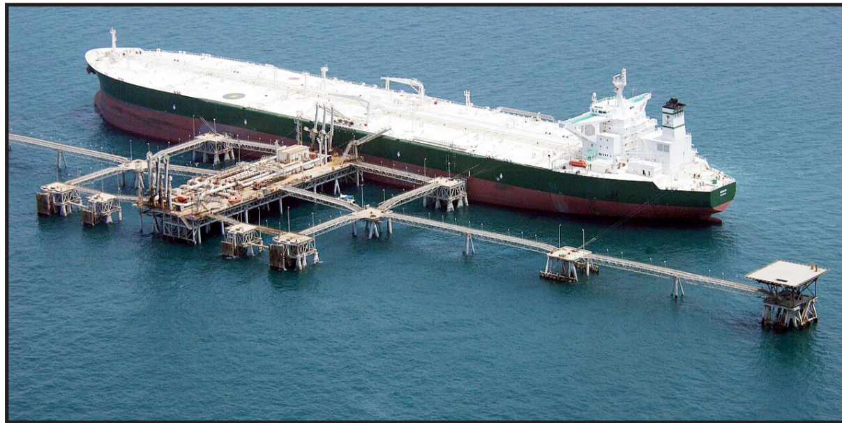
Oil tanker loads with vital supplies

Australia's position is especially revealing. There has been a push to