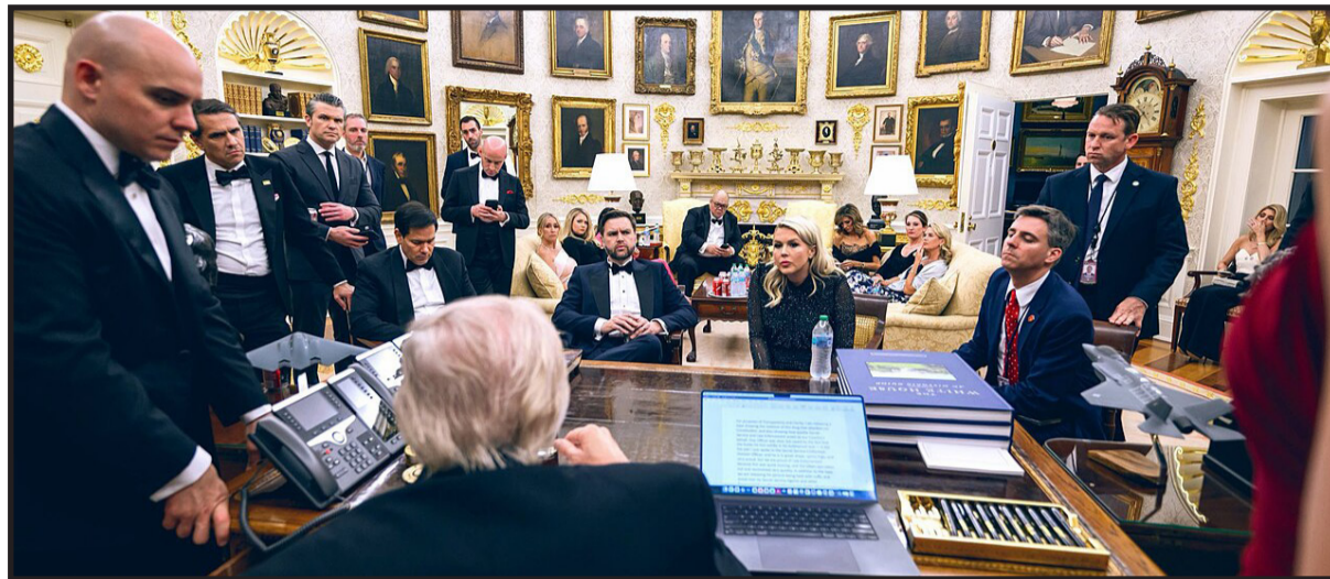
Donald Trump holds court after latest assassination attempt

Indeed, the circumstances will naturally invite speculation. Could this have been a Reichstag fire-type provocation on the part of Trump and his cronies? That cannot be ruled out, of course, but Trump's immediate reaction was not to demand gross restrictions on political freedom for his enemies, but instead to urge the speediest possible completion of his new White House ballroom, which apparently would make this