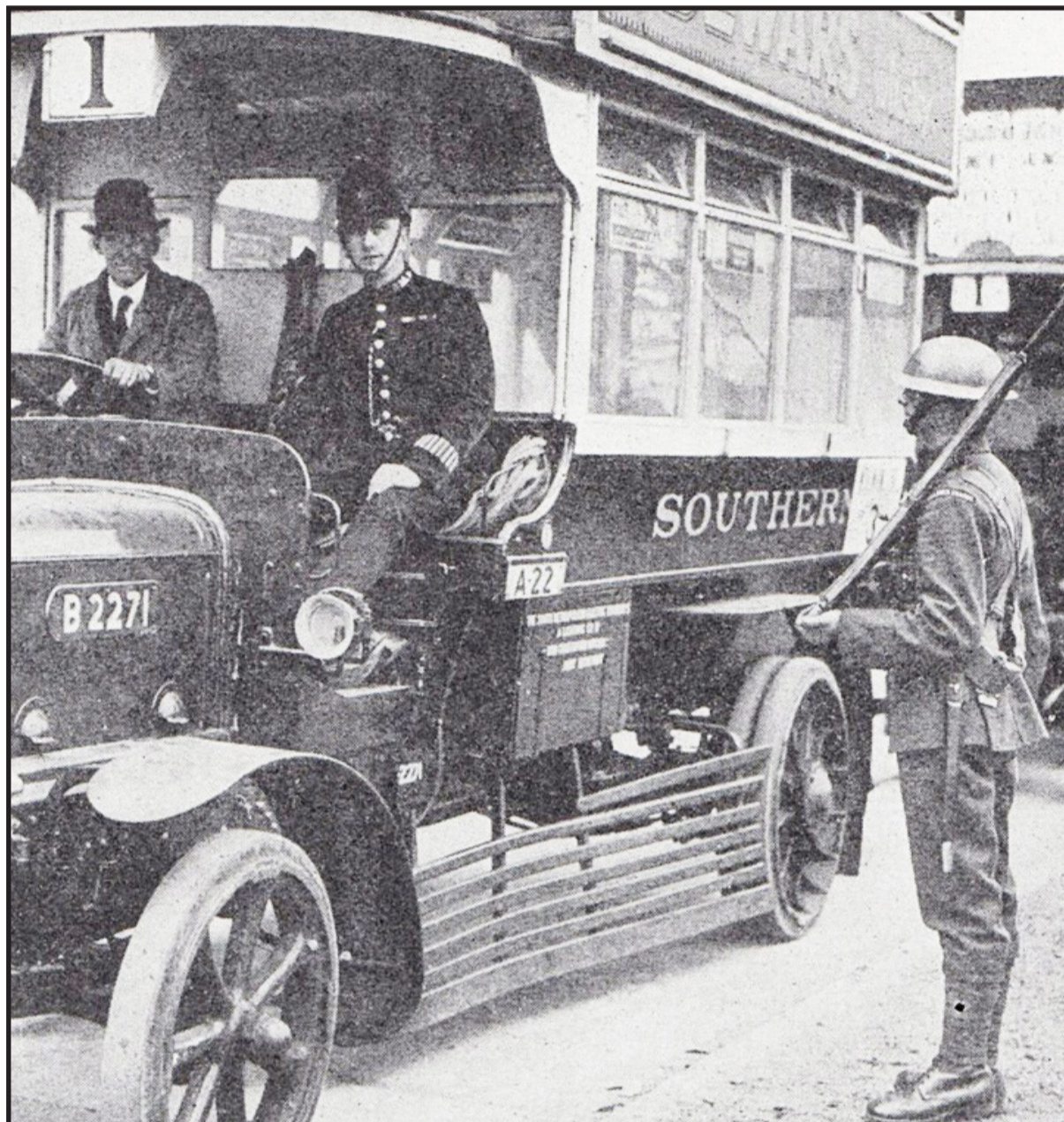
State forces were fully mobilised

Third, the 'official communists'. The Morning Star's Communist Party