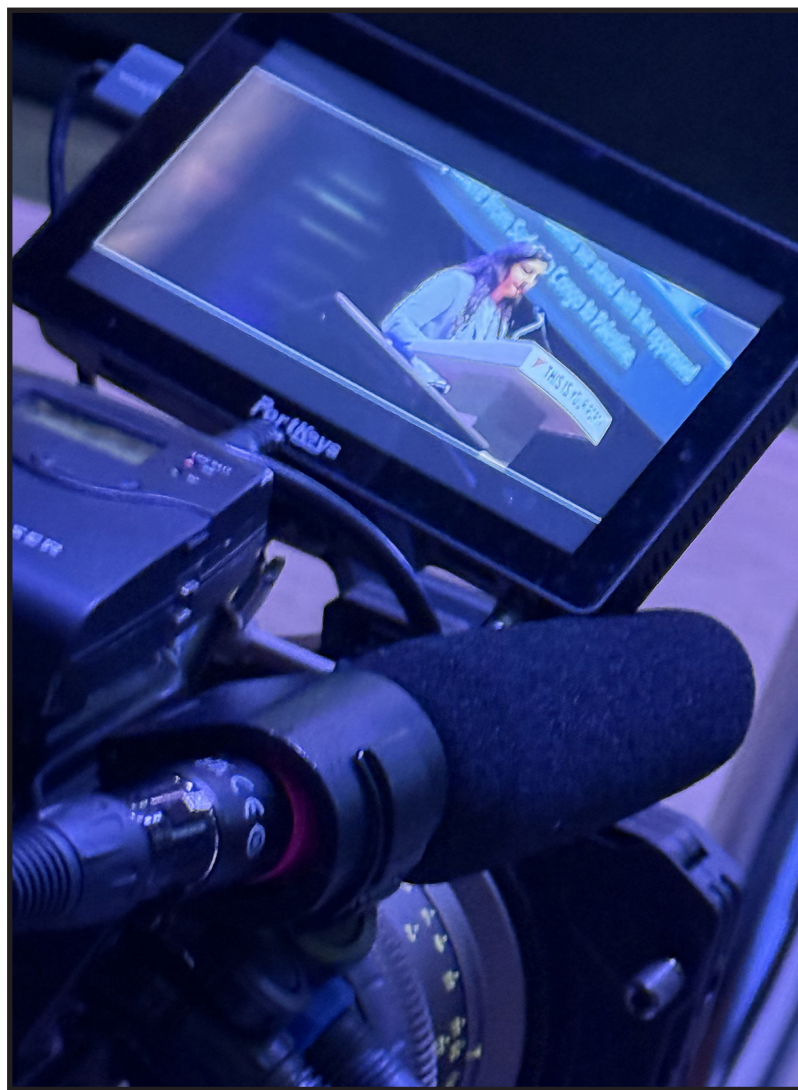
Media smears: a form of factional war

This is analogous to rape cases in universities and other private disciplinary procedures: the effect of doing the internal disciplinary procedure first is to preclude there being a successful prosecution, since the evidence which could be used in the prosecution becomes 'contaminated' by being processed through the