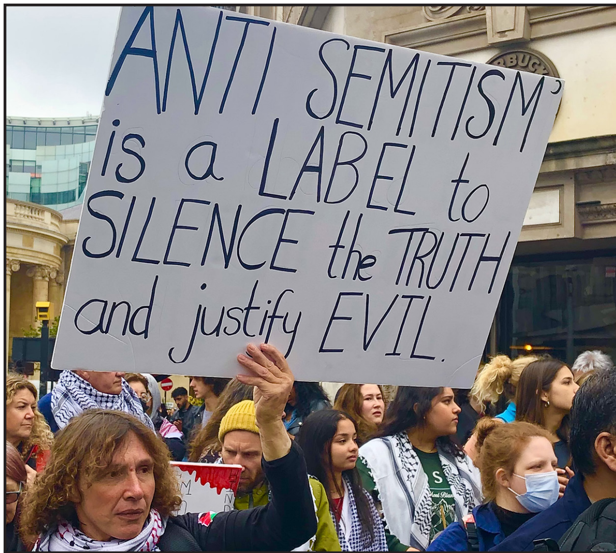
According to the AWL, this is probably yet another example of anti-Semitism