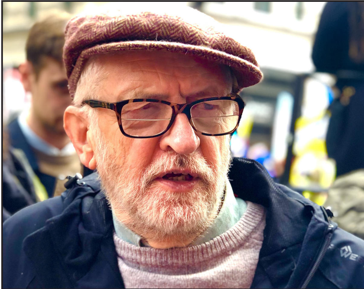
Jeremy Corbyn: still wants to be king of the castle

The departure of Counterfire, and Ken Loach's Platform for a Democratic Party, however, are more serious matters. Both were avoidable, in our view. So, why did they leave