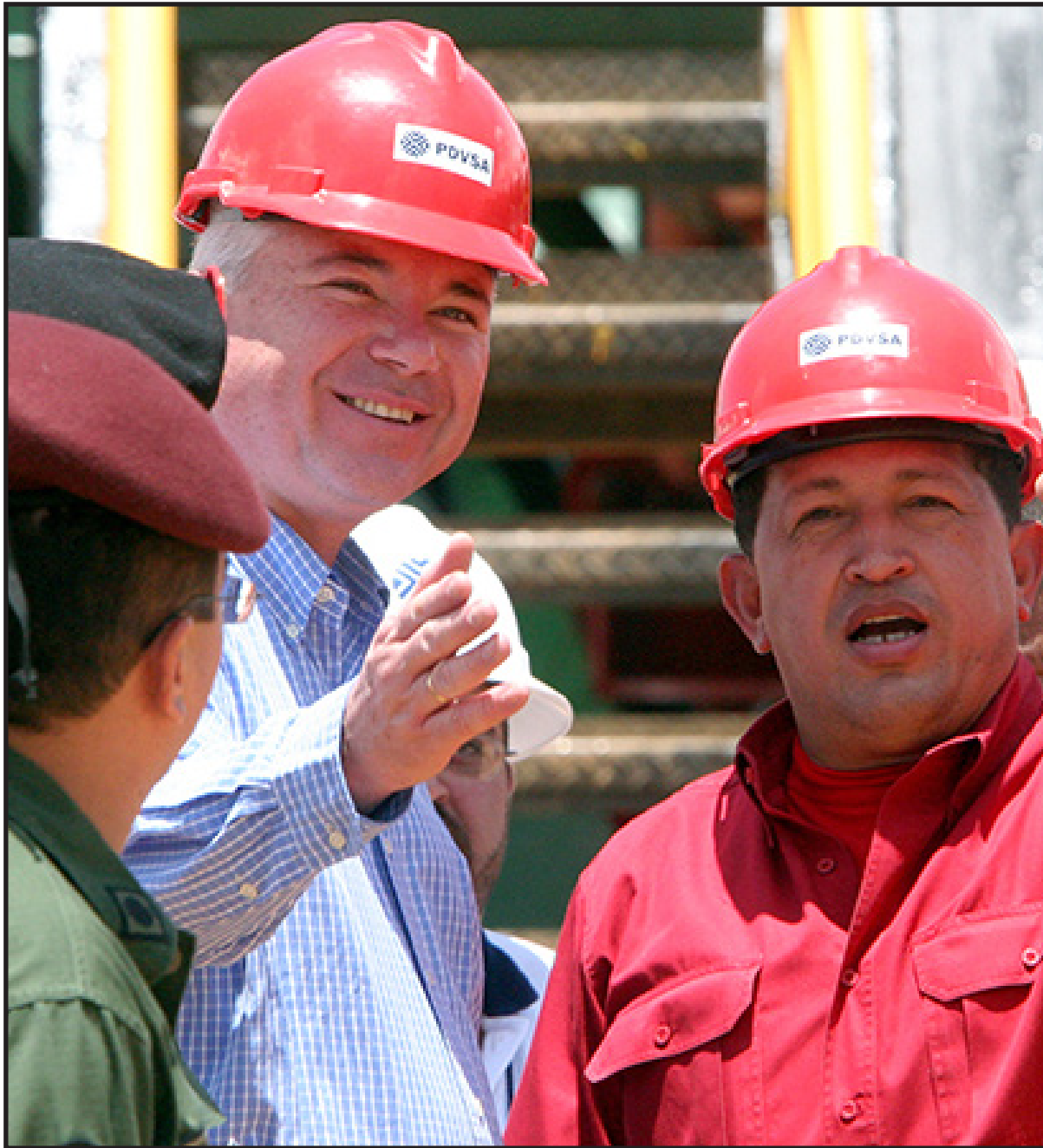
Hugo Chávez: relied on high oil revenues

Moreover, the oil glut has already started to hit profits on further exploration and extraction. The US shale industry’s cumulative losses in the 2010s reached close to half a trillion dollars. 1 Everything depends on the ‘break-even price’, which has been estimated at an average of about $60 per barrel for American shale. 2 All this is occurring against a backdrop of global oil supply growing faster than demand, with the International Energy Agency projecting global supply increases of 3 million barrels a day in 2025 and a further 2.4 million in 2026, against demand increases of only 830,000 barrels in 2025