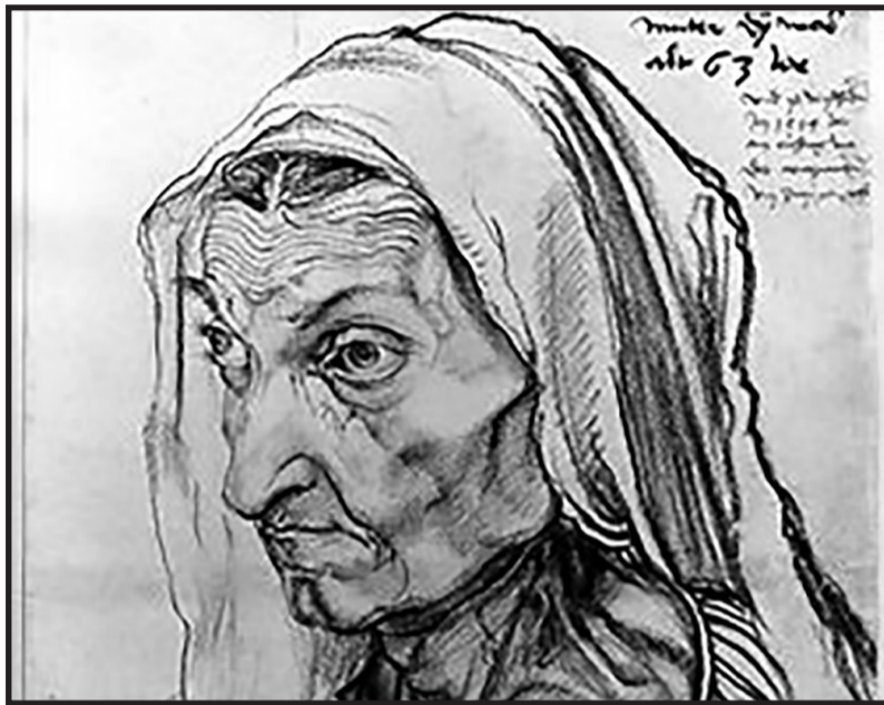
Albrecht Dürer 'Portrait of the artist's mother at age 63' (1514)

Some of the decline in life expectancy is attributable to Covid 19 and the increase in mortality between 2020 and 2022. But the life expectancy improvements have been slow for a decade and not just in the UK. The US has seen similar declines and, as two of the most unequal countries in the world, the UK and US compare unfavourably with other countries with similar levels of economic development.