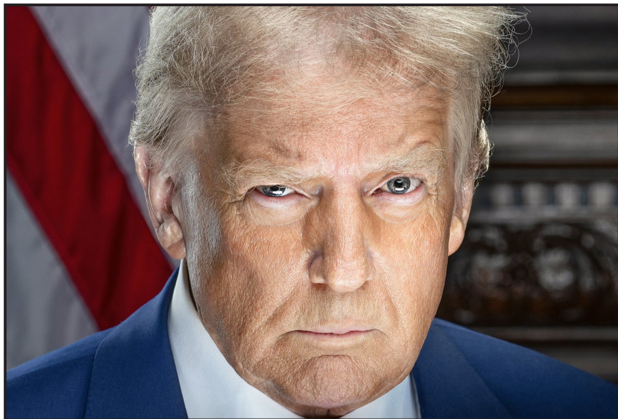
More than a restoration of the Nixon imperial presidency