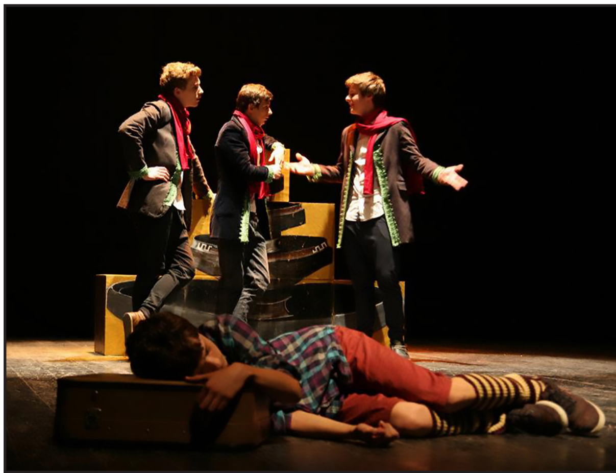
Student drama class: 'The taming of the shrew'

Julie Walters, born into an Irish Catholic working class family in Birmingham, told The Guardian over 10 years ago that "people like me wouldn't get a chance today" because she got a full grant - saying she "don't know how you get into it now" and "kids write to me all the time and I think, I don't know what