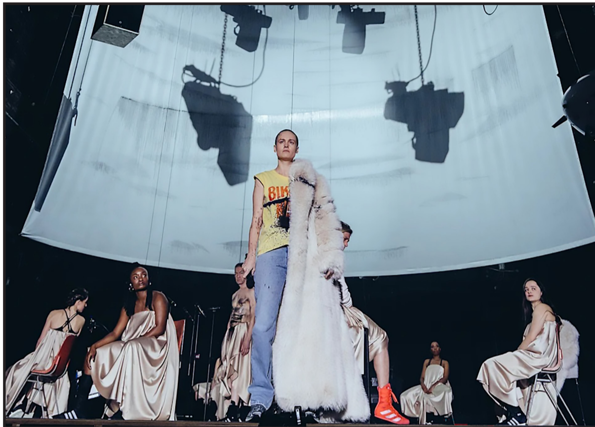
Elektra and Chorus