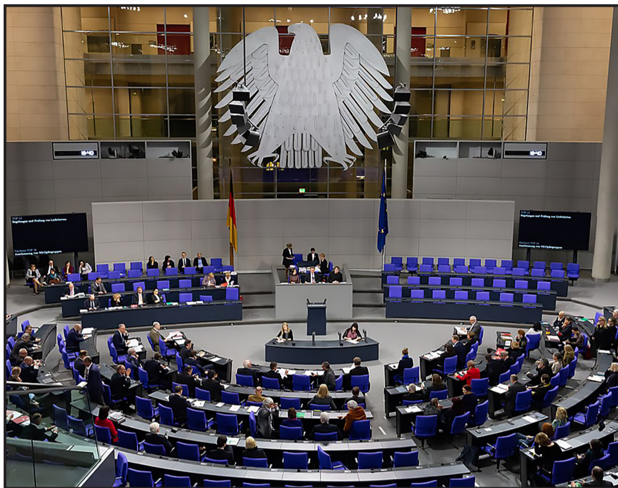
Germany’s parliament: further and further right

We had hoped Sahra Wagenknecht would take similar ‘responsibility’ for the performance of her party, BSW (Bündnis Sahra Wagenknecht), which went from