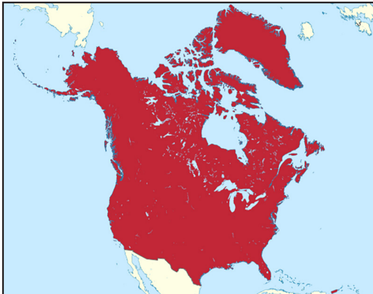
Making America even greater

On a roll, entitled, utterly brazen, tech billionaires - eg, Peter Thiel and deep right thinkers, such as Curtis Yarvin - do nothing whatsoever to disguise their admiration of autocracy and contempt for democracy. In fact there is an open acceptance of what we have long argued: "capitalist democracy" is an "oxymoron". 7 Let us add, for the sake of clarity, that it is Trump, not Elon Musk, who is in charge 8 ... and will be for the next