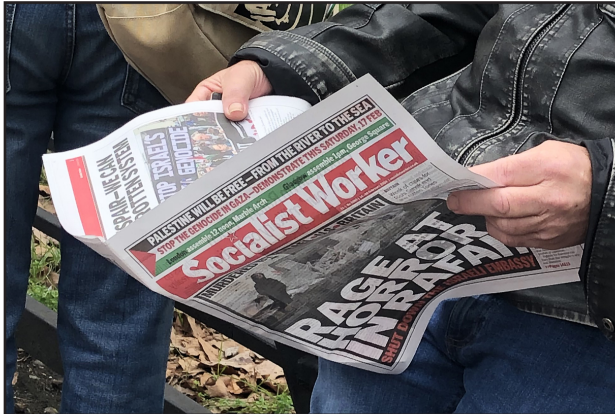
No serious debate, no serious politics