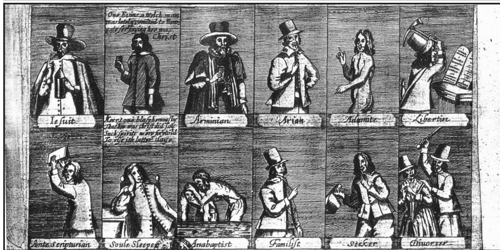
'Catalogue of the severall sects and opinions in England and other nations' (1647)