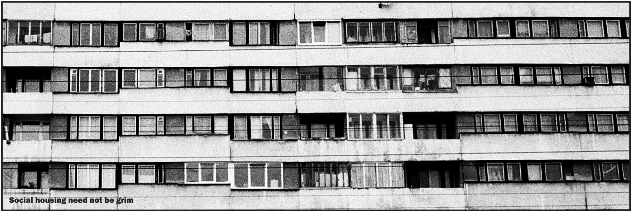
Social housing need not be grim