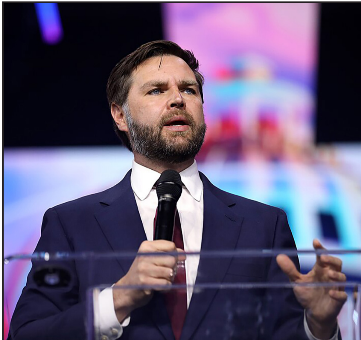
Sending mainstream Europe into meltdown

That Munich meeting was not the first between the party and a figure close to the Trump administration, of course. Now leading a DOGE purge of the US federal government that involves sacking nuclear safety employees, Elon Musk praised the virtues of the AfD last month after its election launch when he hosted Weidel in a 75-minute live conversation on X.