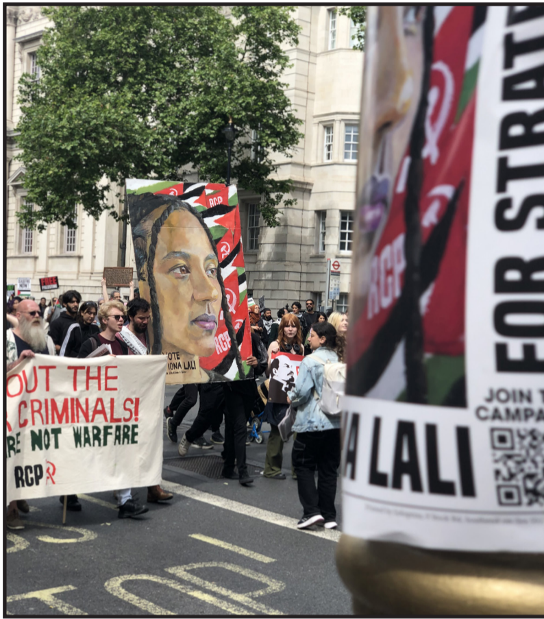
Re, re, revolutionaries in a sub-reformist swamp

Without naming Collective, the editorial raises the possibility of a number of 'left' MPs joining up to a new "alternative" - the main reason being that they will, in all likelihood, not be allowed back into the Labour Party (despite their best efforts):