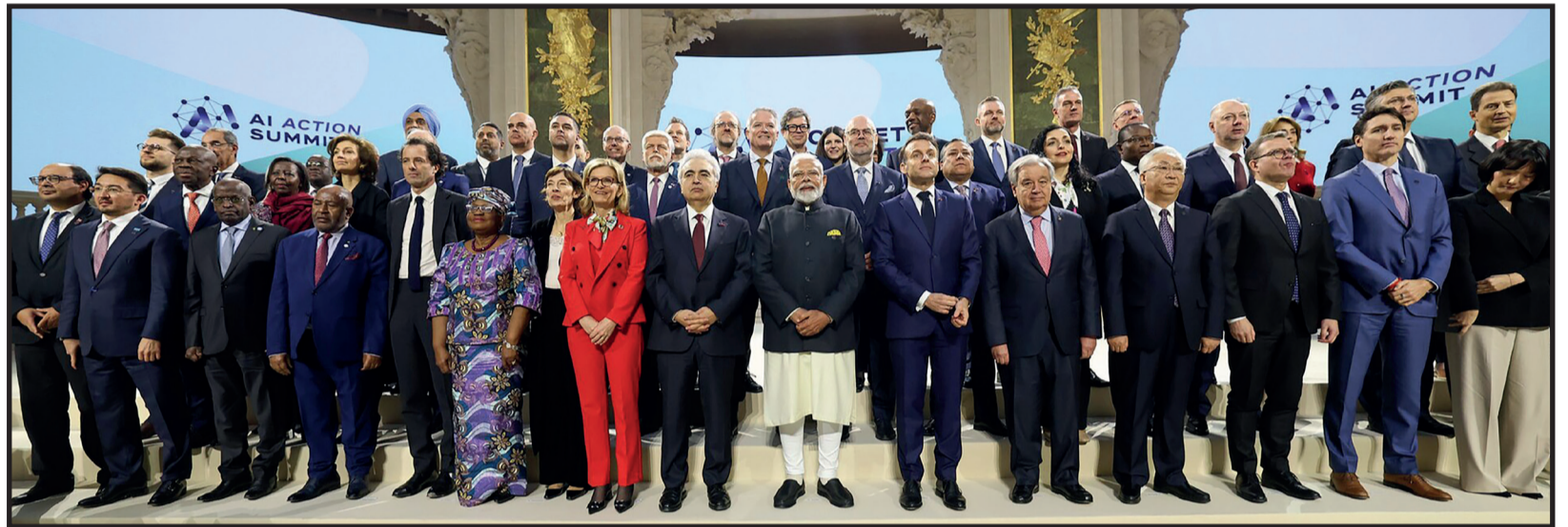
Paris AI Action Summit: know-nothing bigwigs

Of course, these days you cannot have such a conference without a pretence of addressing 'ethical and environmental concerns', and the Paris summit followed this trend. AI expert Yoshua Bengio talked about the potential risks of advanced AI systems, highlighting concerns about issues of control and alignment with human values. There were calls for a moratorium