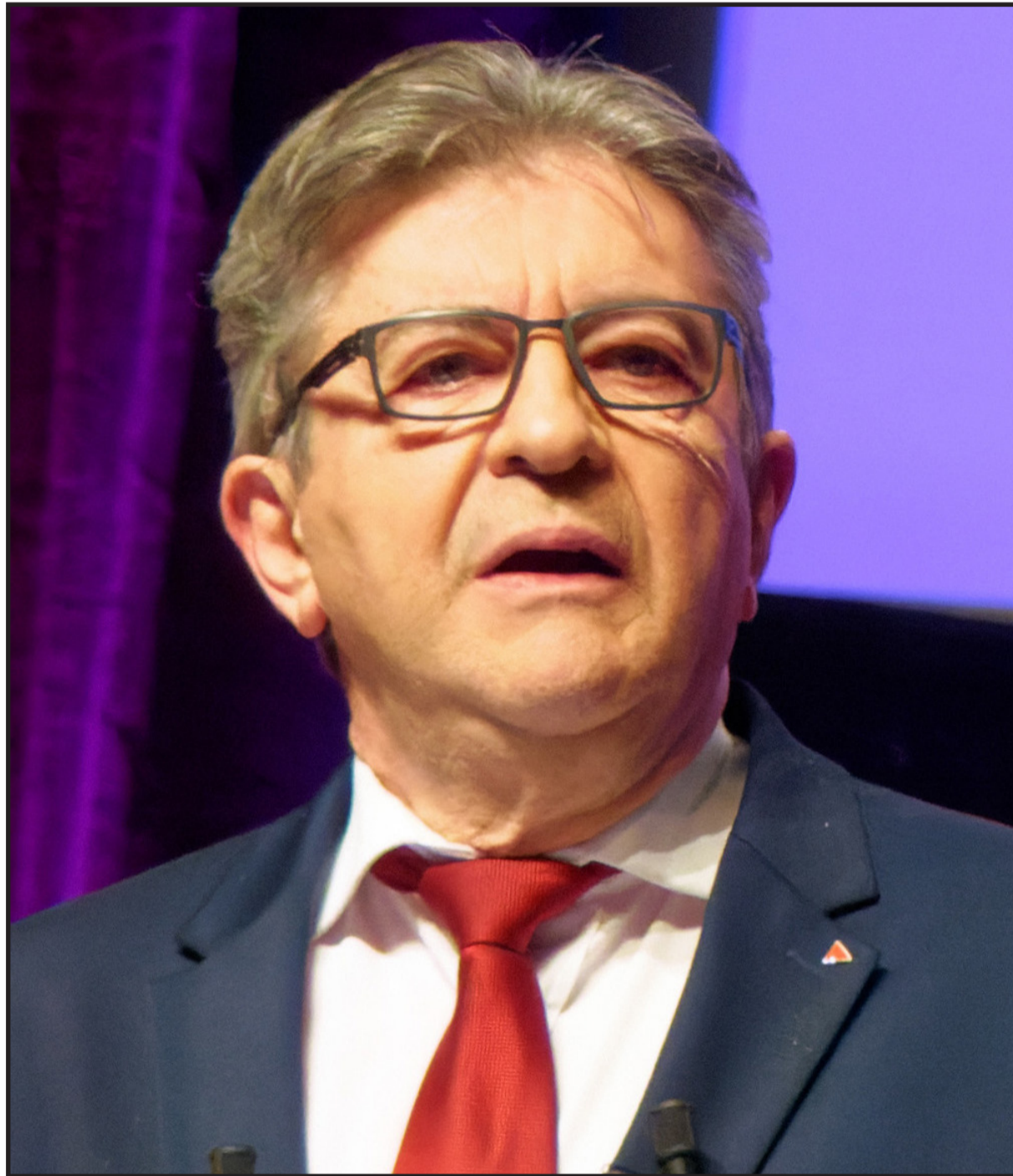
Jean-Luc Mélenchon: LFI proprietor

The French Popular Front was not the first. The Spanish Frente