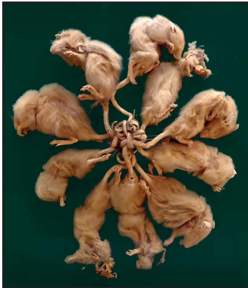
King rat: the best Corbyn's assemblies could produce

Wait, what? First we have to "replicate everywhere" the work he has been able to do in over 40 years as a local MP? How long would that take,