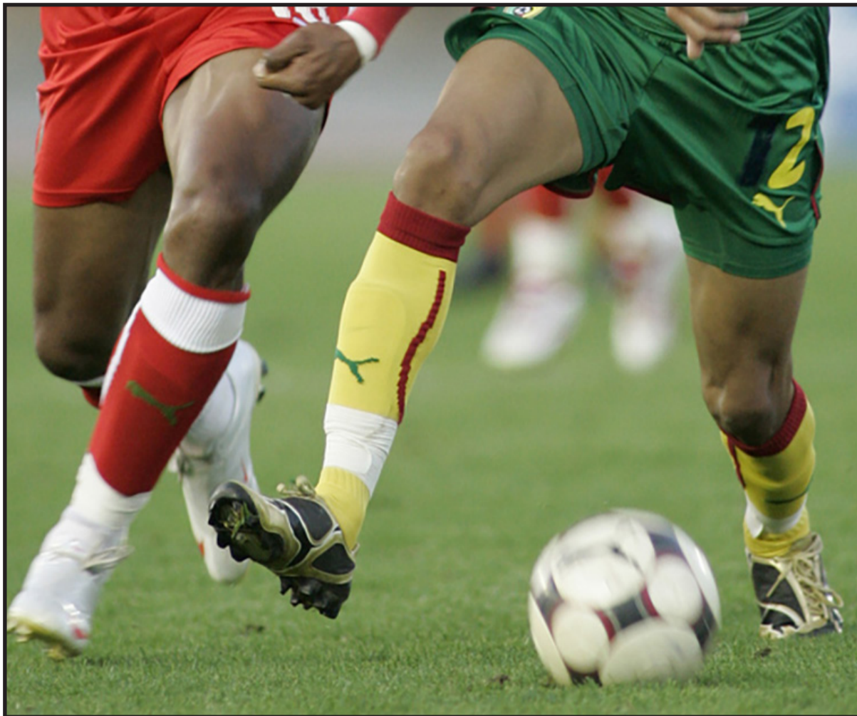
Watched by billions and, for many, held closer than religion

But the game in its modern form - which had a considerable amount of the country engrossed in last weekend's final - has its origins in 12th century England. A team game, usually involving neighbouring villages, with the purpose of the transporting an inflated pig's bladder to a marker in the opponent's village. And, as the description from Elyot suggests, it was certainly considerably more violent than the modern-day game. There are examples of punching, biting and kicking, resulting in broken bones and even fatalities. There were no clearly defined regulations; no referee; no limit to the number of participants in any single match; no defined size for the playing area (sometimes the play area covered several acres); and there was no time-limit. Sometimes it lasted just a few hours, sometimes days. 3