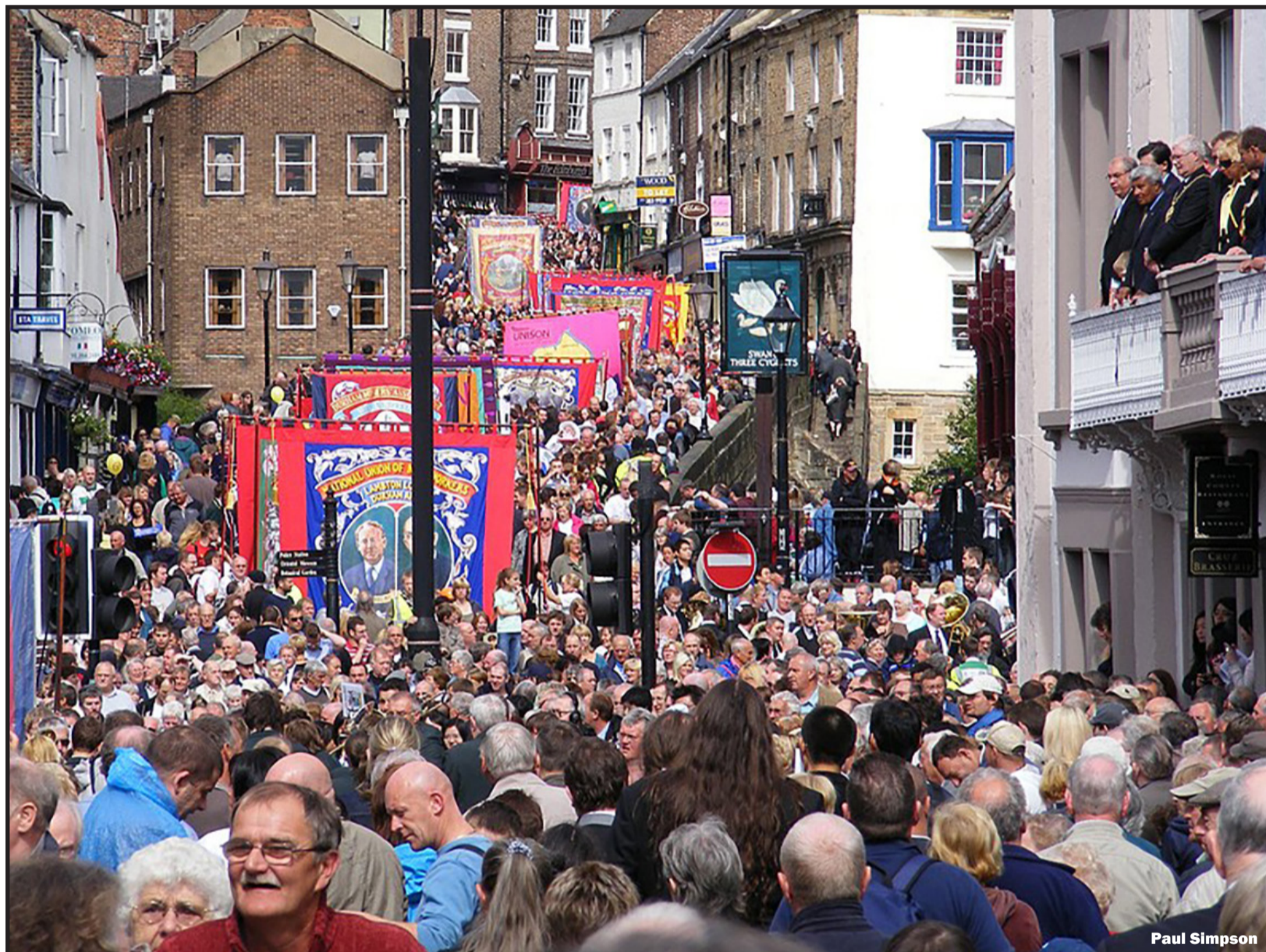
No Labour tops this year: good

Fabians there were aplenty. The Workers Party of Britain had a big expensive tent, with a large picture of the Dear Leader, George Galloway. Ironically, the Labour