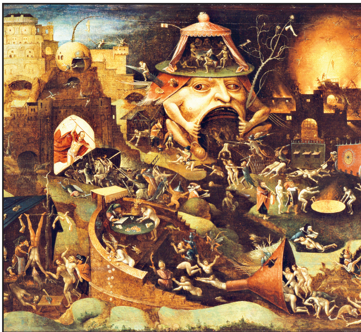
Follower of Hieronymus Bosch 'The harrowing of hell' c1500

The refusal to see - the strange magical thinking at work - brings to mind certain other episodes in American history. Dred Scott - though a judicial decision of the Supreme Court rather than a legislative one - jumps out: a last-ditch attempt to assert that slavery is