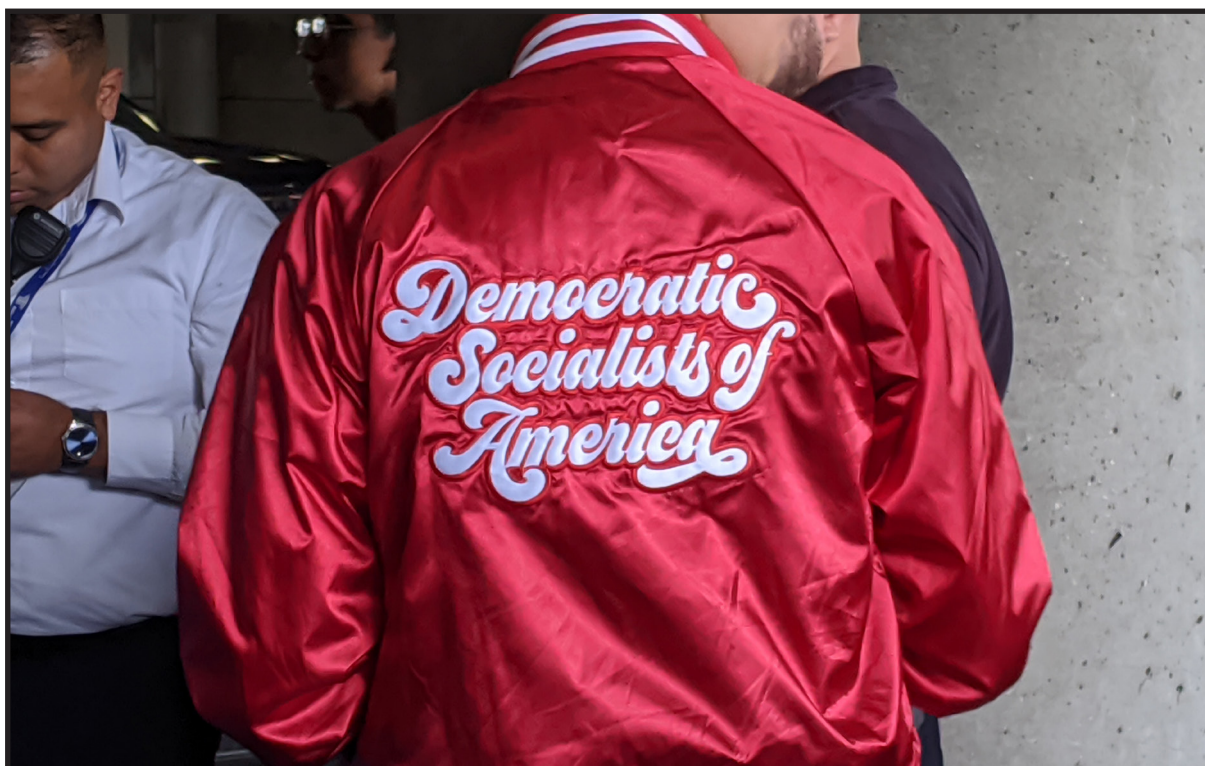
Easy route to mass base would be a fatal route

It continues by making reference in support of the goals of the DSA's 'Rank-and-file strategy', and the YDSA's support of it - prioritising in particular "rebuilding the labour movement through shop-floor organisation, advancing democracy and a class-struggle orientation in our unions, and challenging conservative union bureaucracies " - and, making reference to Kautsky's famous formula, seeks the "merging [of] socialism with this rank-and-file movement". Stating that "democratic socialism is built upon working class power, and the multiracial working class is the only agent that has the ability to create democratic socialism", it concludes that "direct accountability to and representation for unions will make