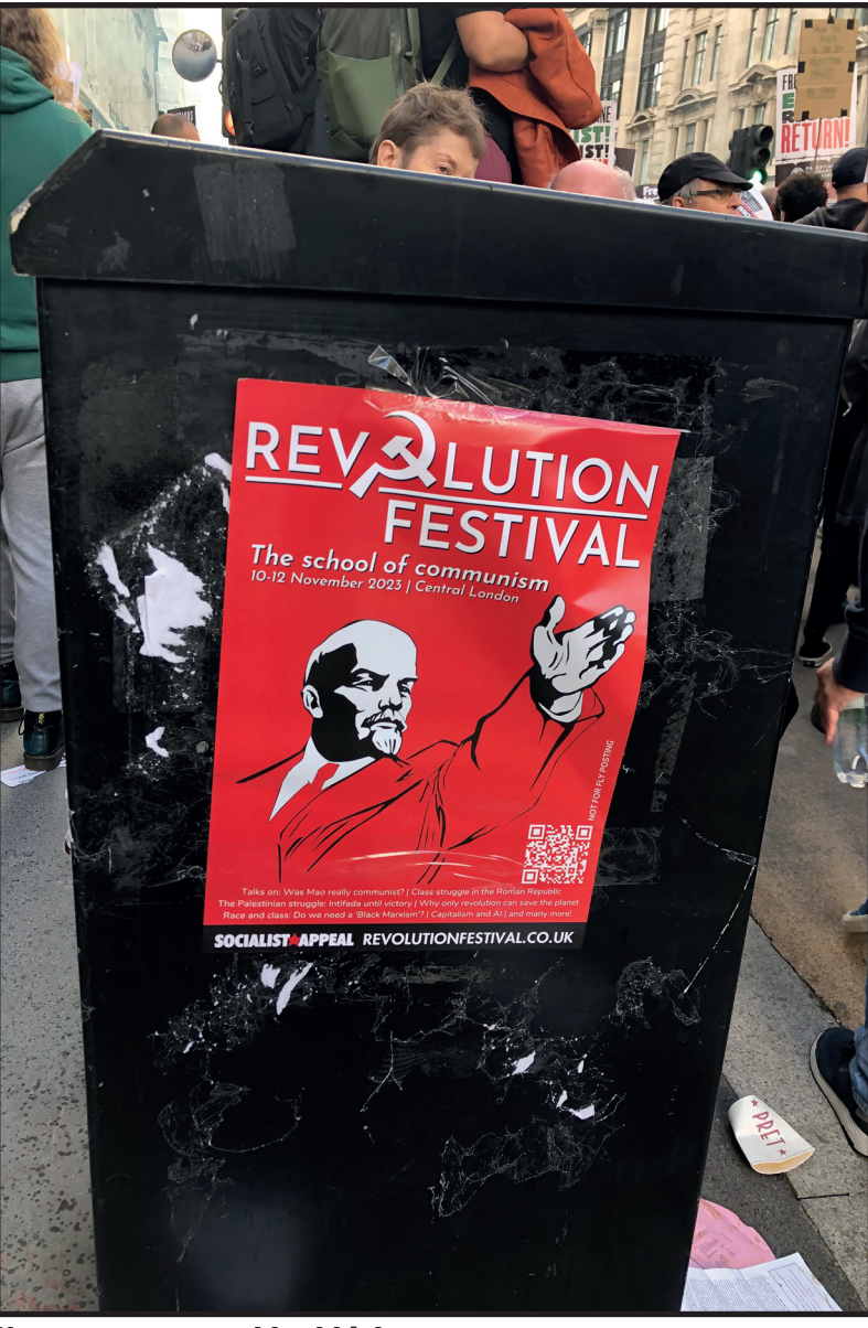
New name, same old rubbish

The second positive feature of the text is the general shift of Socialist Appeal to open self-identification as 'communist', of which this document is part. The Trotskyist and sub-Trotskyist far left has for too long imagined that calling themselves 'socialist' or whatever allows them to escape being identified as communists - it never worked. The effect was usually just to give an impression of dishonesty. This appearance of dishonesty would only be reduced where groups actually broke from communism, in the sense of rejecting the essential claims of opposition to imperialism and to their own country's imperialist wars: but the usual consequence of this policy is, as with Schachtman, with the ex-Trot 'neocons' or with the 'Eustonites', to cease even to be leftists in any usable sense of that indeterminate term.