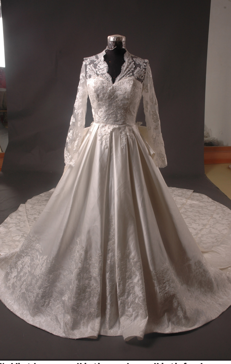
Wedding dress: everything is posed, everything is for show

All of which only makes the rather limited sense that it does because Kate is currently withdrawn from public life, following an abdominal operation in January. Nobody likes to hear the word 'operation' used in connection with a public figure with whom they have an unhealthy obsession. The reality of major abdominal surgery familiar to those who have undergone it, or know people who have - is a fairly long recovery. When fitness coaches talk about your core strength, they are talking about precisely the bits that the surgeon has been rearranging; rather basic activities are difficult, and it is hardly unusual or alarming for the patient to take a long time to convalesce. Needless to say, you probably do not want to be bundled