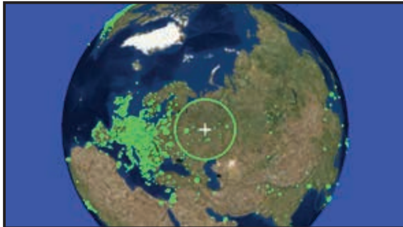
Global impact predicted

First of all, it is vulgar to compare the reign of absolutism with that of the bourgeoisie. Absolutism is a form of government. The bourgeoisie is a class which can rule under the most diverse forms of government. If we do not draw a nonsensical comparison between the existence of a form of government and the reign of a class, but if we instead compare different forms of government,