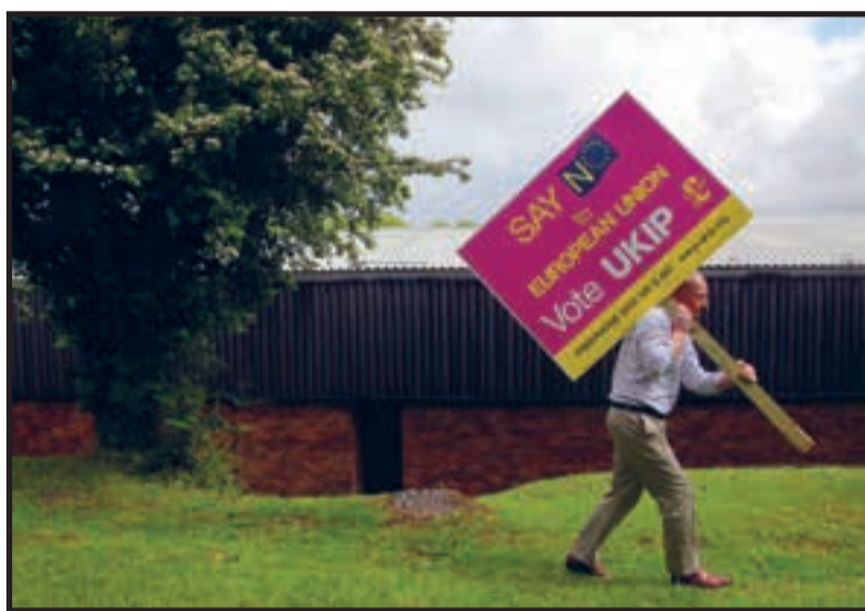
The party is nearly over

Sked was ousted by a faction - led by (among others) the promising young City boy, Nigel Farage - which wanted to dispense with the founder's liberalism and align politically with the Tory hard right - the mainspring of Euroscepticism. A real breakthrough would have to wait a while, partly because at that time the field was not clear. Nick Griffin had had some success reorienting the British National Party from straightforward fascism to an ethnocentric Poujadism, inspired by France's Front National. Ukip's first major tilt at the big time had to wait until Robert Kilroy-Silk - once a Labour MP, but by the mid-aughts more famous for his racially intemperate tabloid broadsides against Arabs - took up the purple and yellow standard as his own, before falling out spectacularly with the established leadership and flouncing