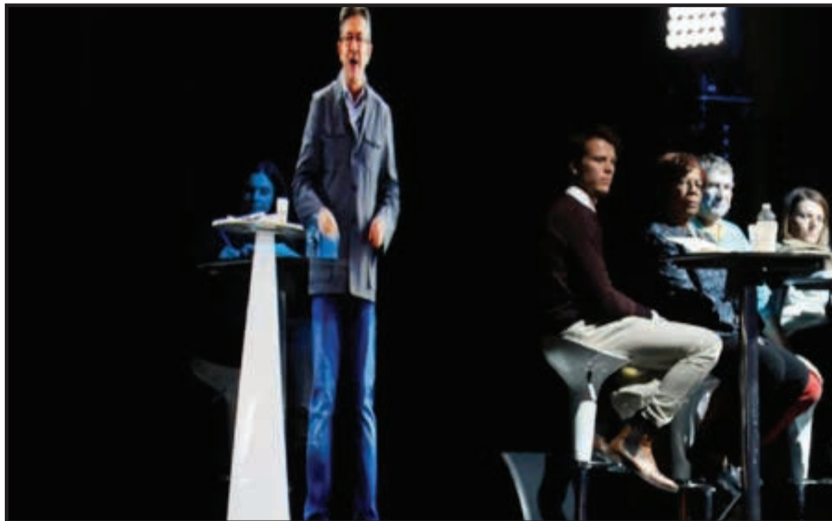
Mélenchon: holographic projection

The French Communist Party (PCF), founded in 1920, has been a junior partner in French governments on three occasions. In the Provisional Government 1944-46; at the beginning of Mitterrand's presidency 1981-84; and in cabinet under prime minister