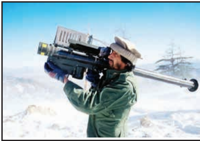
Afghan mujahedin and US supplied Stinger missile