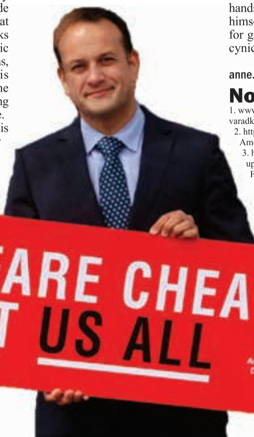
Leo Varadkar: nasty