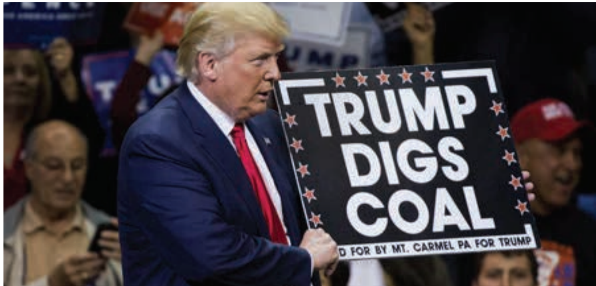
Pittsburgh Trump rally

As well as being non-legally binding, the solemn promises made at Paris to cut carbon emissions (intended nationally defined contributions, or INDCs) are totally insufficient - despite article 3 of the agreement, which requires them to be "ambitious", "represent a progression over time" and set "with the view to achieving the purpose of this agreement". In fact, according to several analyses, even if the plans were kept to they would still lead to a 2.7°-3° rise in temperature - which would be potentially catastrophic. 3 The European Union, for instance, has an INDC of cutting emissions by 40% by 2030 on 1990 levels, and the US - before it pulled out - by