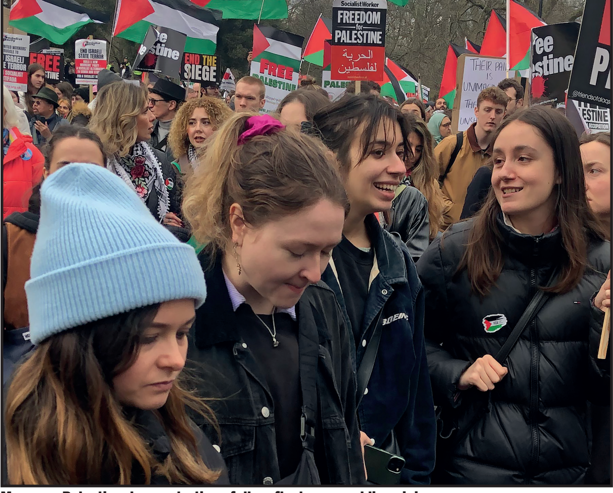
Mass pro-Palestine demonstrations fully reflect mass public opinion

Anyway, what was particularly striking about the poll of British