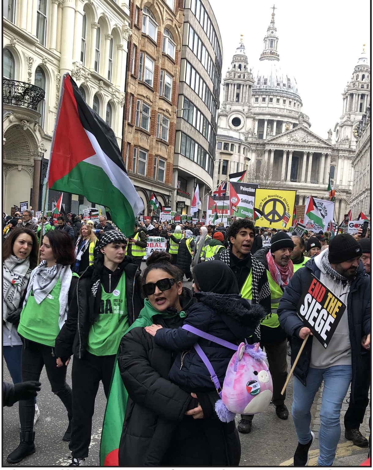
Mainstream politicians are completely out of touch when it comes to Gaza and Palestine

I am unsure what changes the motion went through before reaching this final composite made up of submissions from three CLPs, but it was clearly designed to merely signal the presence of a heart in the Labour Party without saying anything substantively different to a generic