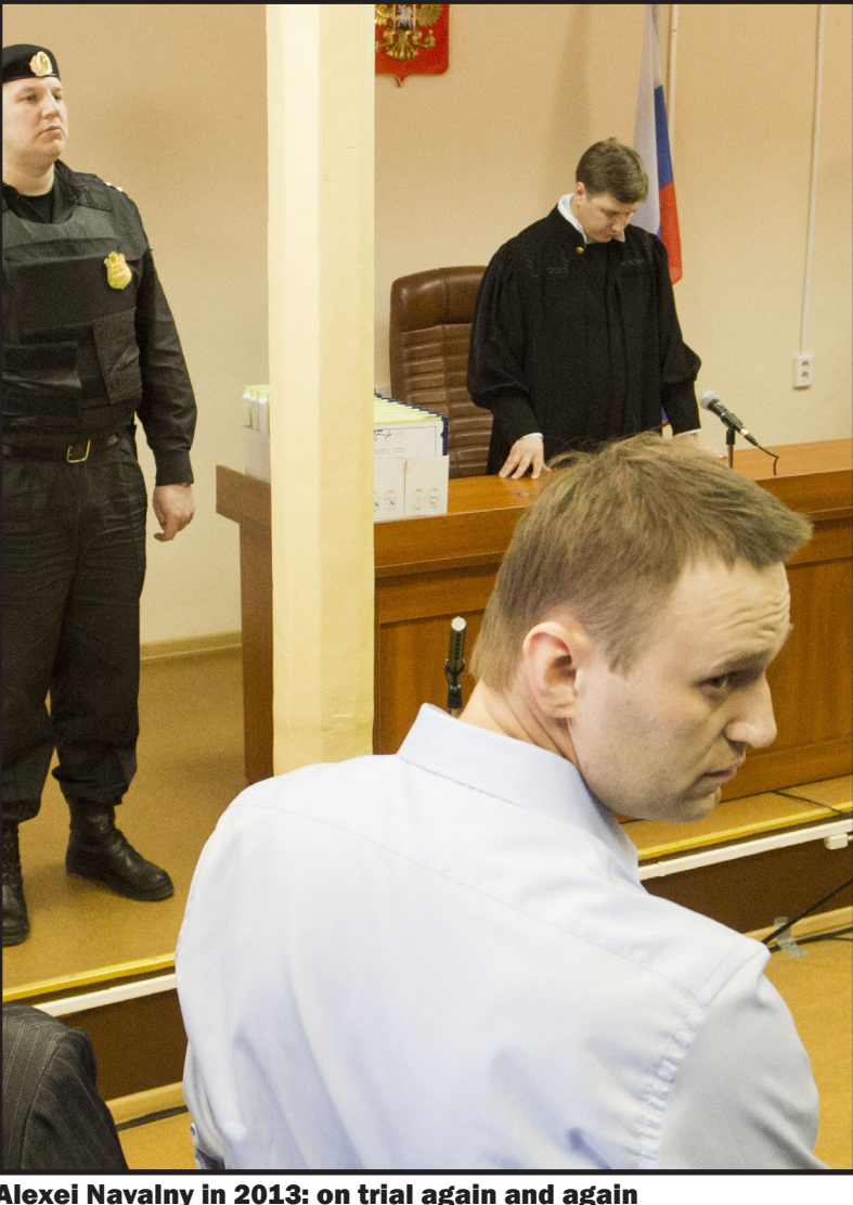
Alexei Navalny in 2013: on trial again and again

The obvious answer is that he was the chosen avatar of the United States and its various more-or-less distant agencies in global affairs - from the secret state to coopted arms of civil society - NGOs, human rights courts and Nobel committees. Despite the hysteria of the Trump-deranged liberal media in the US, Russia has no comparable machinery. The crudity of its methods - nerve