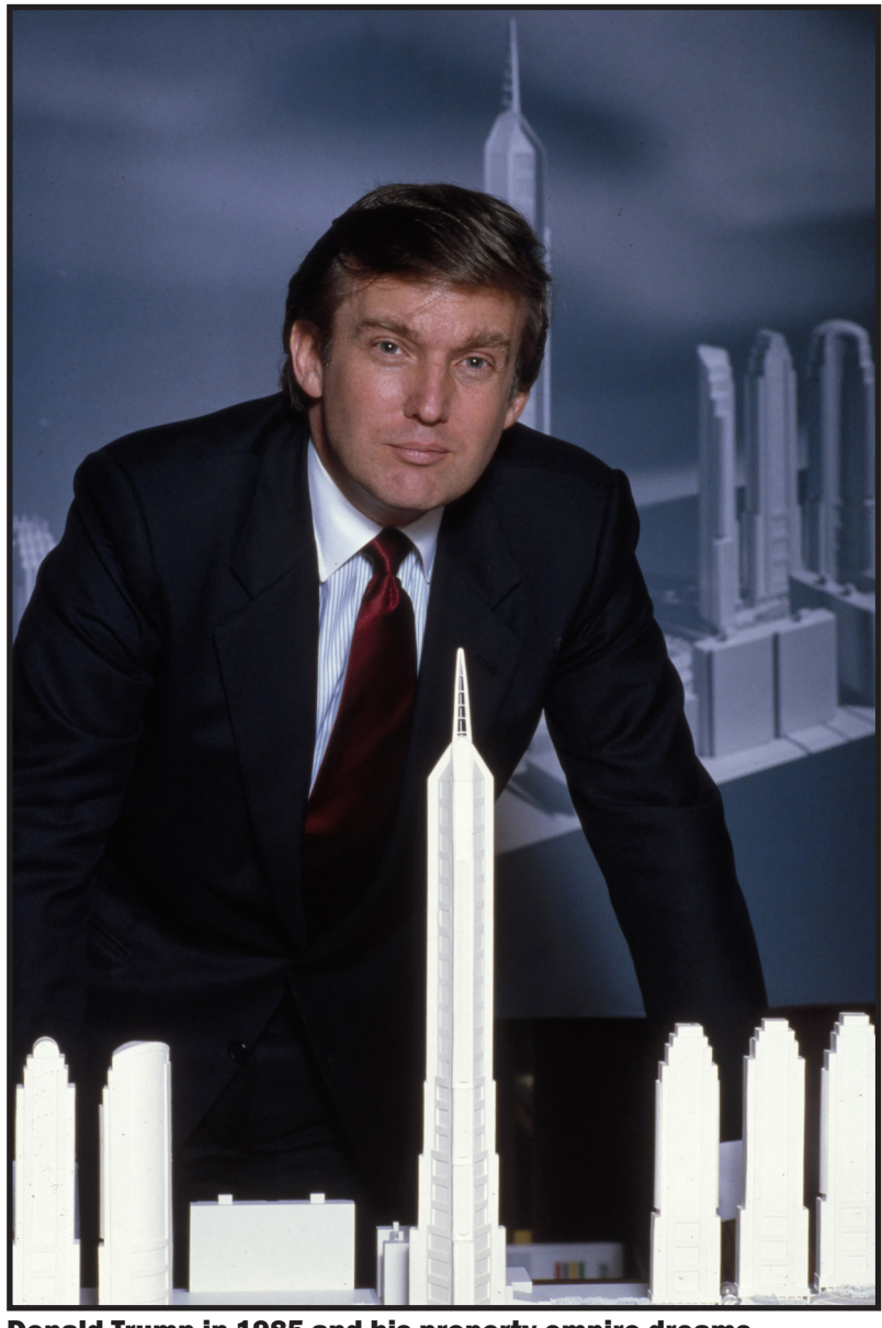
Donald Trump in 1985 and his property empire dreams

a drone strike in Yemen that killed Anwar al-Awlaki, an al Qa'eda leader who was also a US citizen, in 2011. Two weeks later, Obama ordered a second strike that killed al-Awlaki's 16-year-old son.