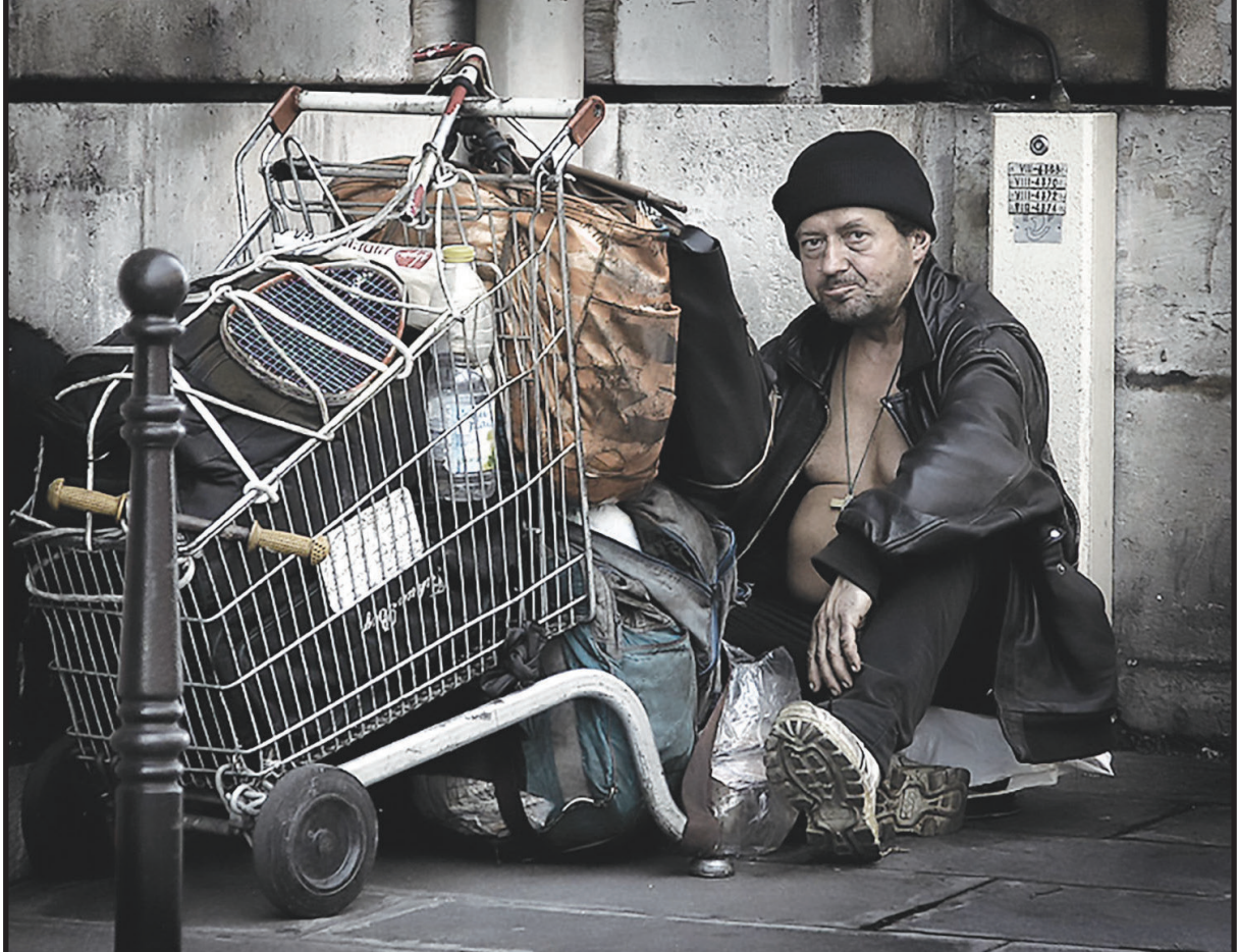
A grim life

If Braverman's vision of hell drew on the horror stories of social breakdown and moral collapse that she has picked up from her frequent meetings with the wilder shores of the American conservative right, it also drew on reactionary bile and