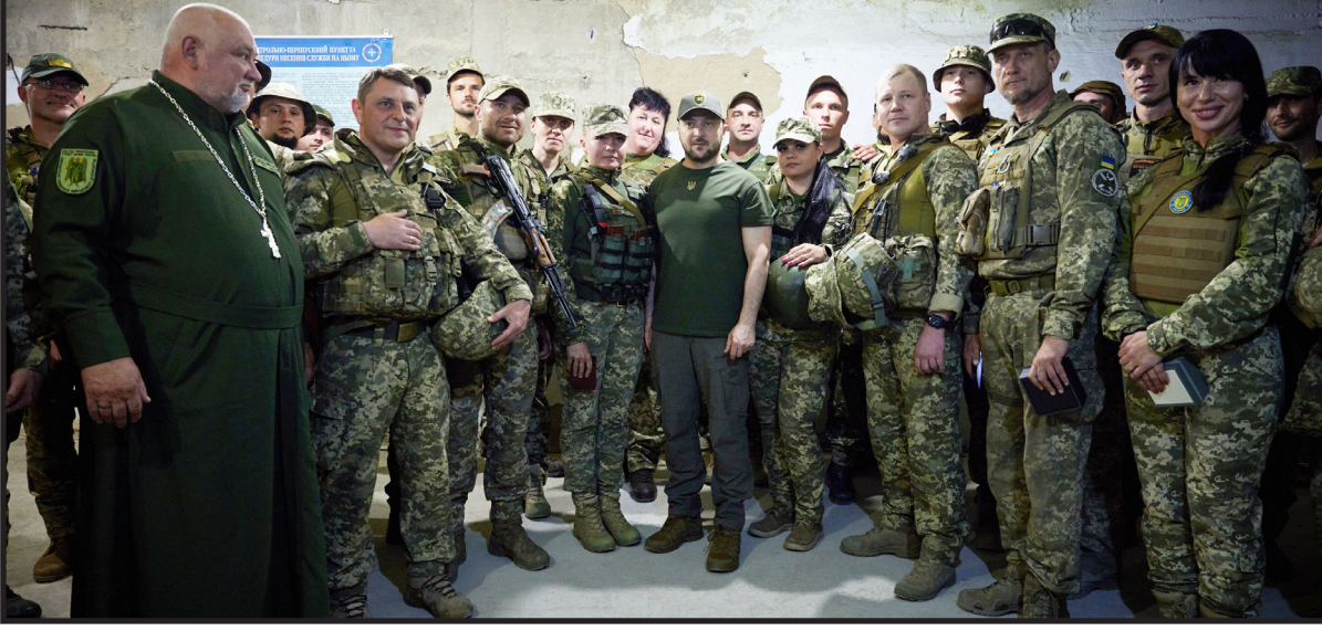
Volodymyr Zelensky: his army is losing

A poll issued on November 5 by The New York Times and Siena College in upstate New York brought particularly bad news. Donald Trump, it found, is leading by as many as 10 percentage points in five of the six key battleground states that could well decide the 2024 election