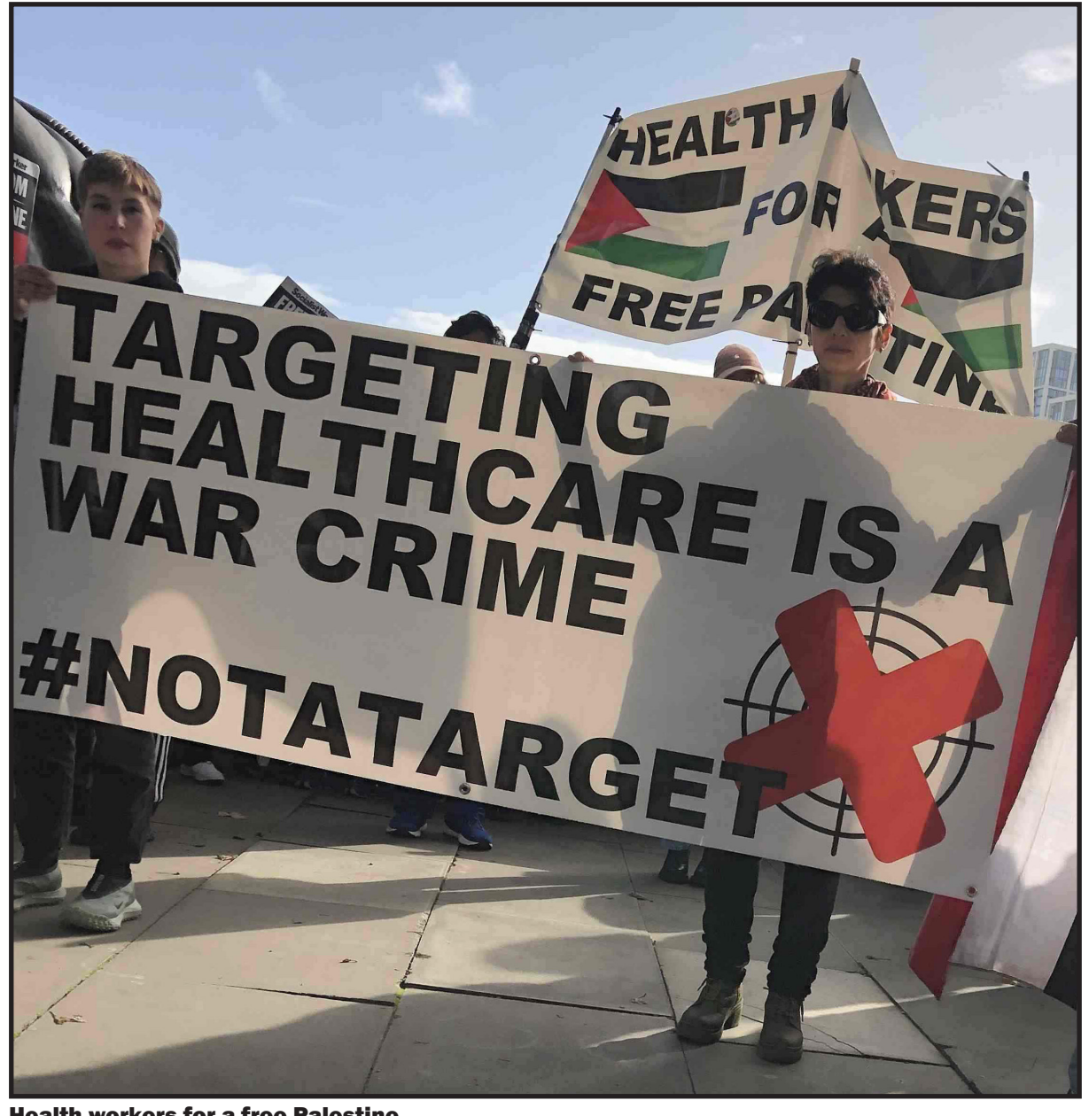
Health workers for a free Palestine

The World Health Organisation has condemned the attacks on the Al-Shifa Hospital, Al-Quds Hospital and the Indonesian Hospital in Gaza City. WHO has pointed out that women, children and newborns disproportionately bearing the burden of the slaughter and represent 67% of all casualties. The bombardments, displacement of population, destruction of health infrastructure, collapsing water supplies and restriction of food and medicines have severely disrupted maternal, infant and child health