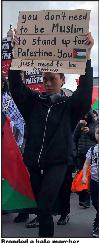
Branded a hate marcher