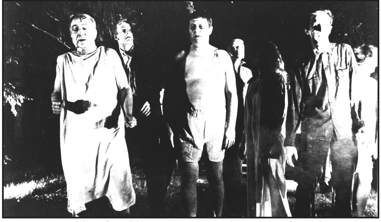
George A Romero 'Night of the living dead' (1968). There is something of the living dead about today's post-Corbyn soft left