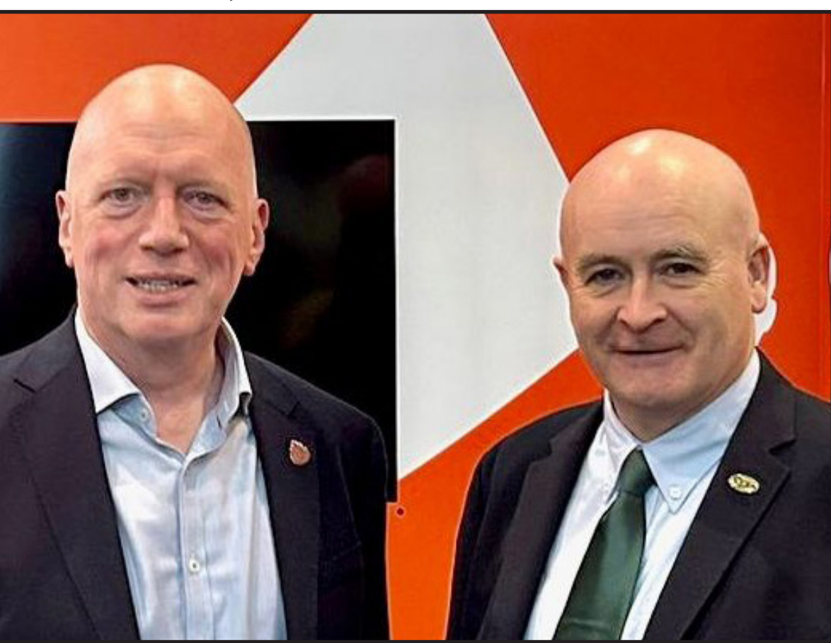
Matt Wrack and Mick Lynch: brothers should become comrades

opposition to the minimum service levels laws, up to and including a strategy of non-compliance and non-cooperation to make them unworkable, including industrial action." Matt Wrack, Fire Brigades Union general secretary and the newly elected TUC president, described it as a "message of defiance" to the government, signalling that "this government's nasty, authoritarian agenda will be vigorously opposed by the trade union movement".