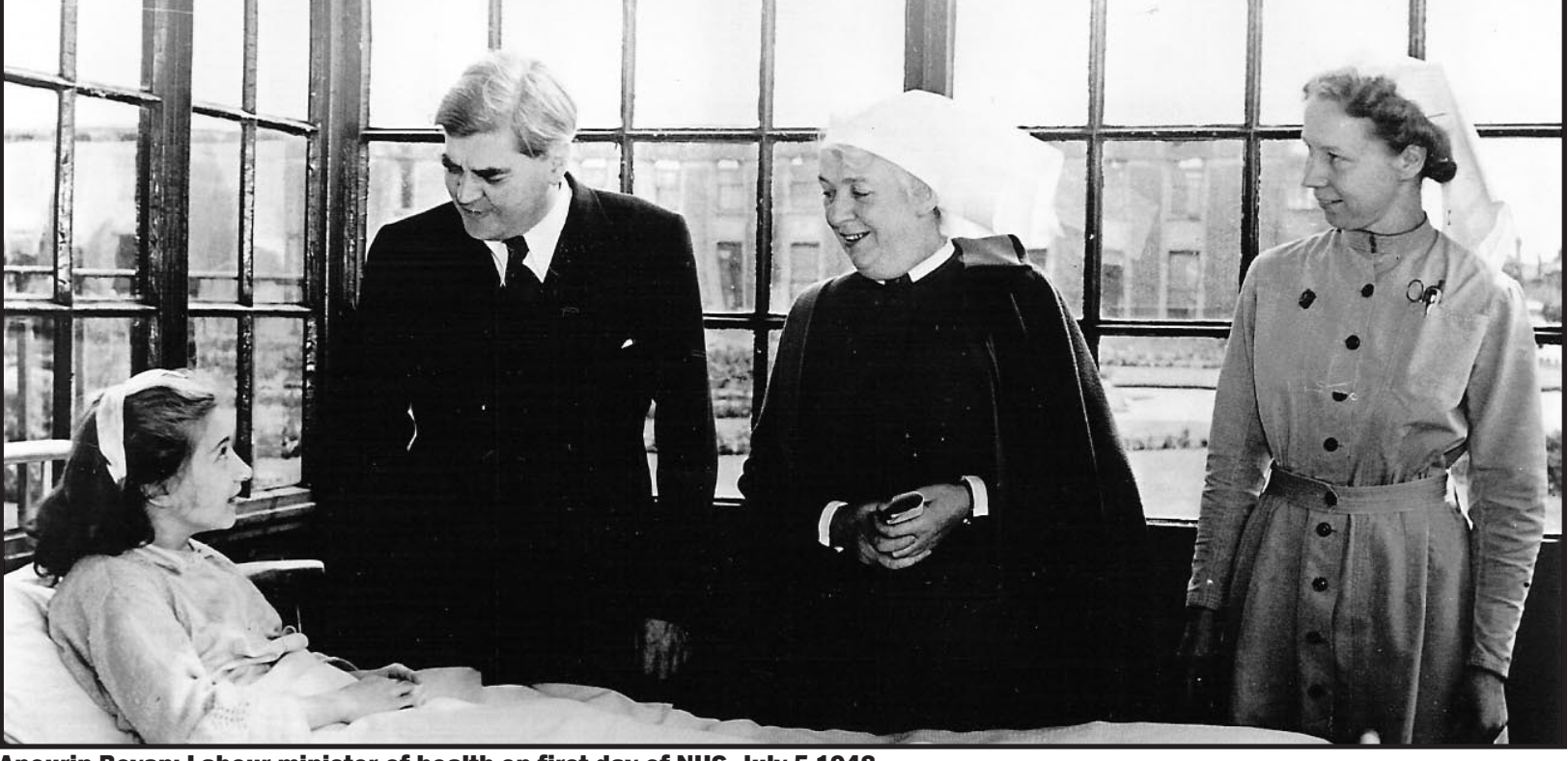
Aneurin Bevan: Labour minister of health on first day of NHS, July 5 1948

Many of the supposedly innovative ideas, such as apprentices, nursing and physician associates, have already been in place for