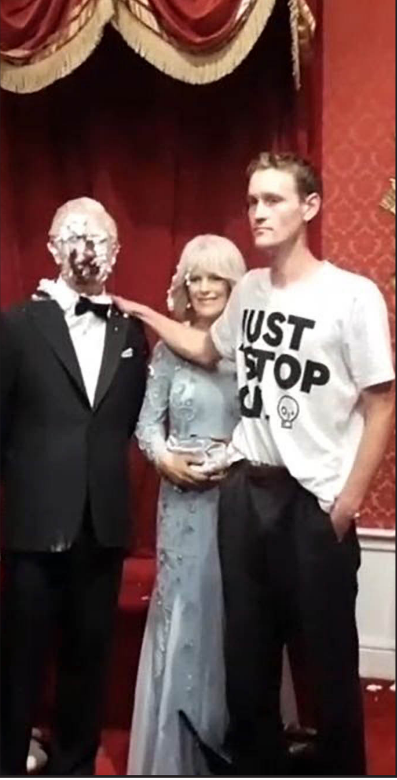
Madame Tussauds stunt: why stop at a waxwork?

Of course, this report follows February's final part, or 'synthesis', of the sixth assessment by the Intergovernmental Panel on Climate Change - intended to be the scientific 'gold standard' of advice for this decade, given that the next IPCC report is not due to be published before 2030. They concluded that to maintain a "50:50 chance" of warming not exceeding 1.5°C above pre-industrial levels, CO<sub>2</sub> emissions