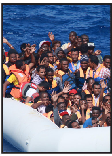
Desperate, but determined

One bright idea of the Tory right is to include a pledge to hold a referendum about leaving the ECHR in the general election manifesto. If that happens, and if the Tories win, and if the referendum happens, and if the referendum goes against the ECHR, and if parliament votes through the necessary legislation, then the UK would join Russia and Belarus as the only non-ECHR signatories. At lot of ifs, but it does explain why there is such disquiet about the Tories amongst the top ranks of the civil service. Leaving